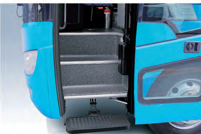
Passenger Door with Electrical Step