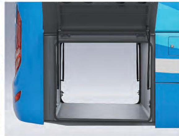
Rear Luggage Compartment