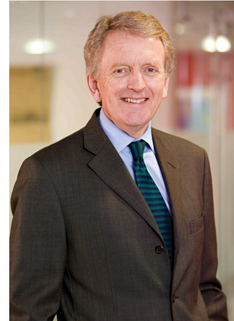
Sir Christopher Meyer KCMG Chairman

A list of the Commission members is available on the PCC website: www.pcc.org.uk/about/whoswho/members.html