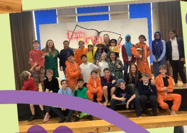
"One word PGL!" 6D