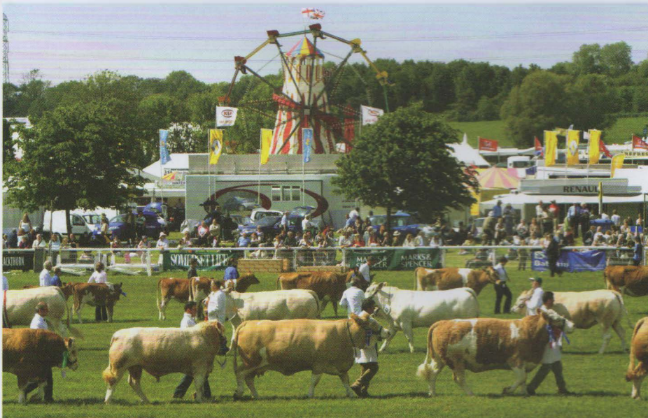
Royal Bath and West Show

For more information about key employment sites, commercial property availability and further information about the LDO and Food Enterprise Zone projects, contact economy@mendip.gov.uk or visit: www.mendip.gov.uk/business www.intosomerset.co.uk