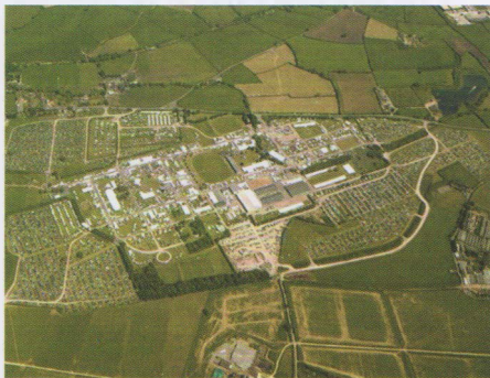
Bath & West aerial view

The Bath & West LDO provides a simplified planning offer for new development within B1 (offices, light industrial and research and development), B2 (general industrial) and B8 (storage and distribution) use classes. Units with a floor area of up to 25,000 sq metres, with a maximum height of 10m and two storeys will be exempt from normal planning fees and Section 106 planning obligations.