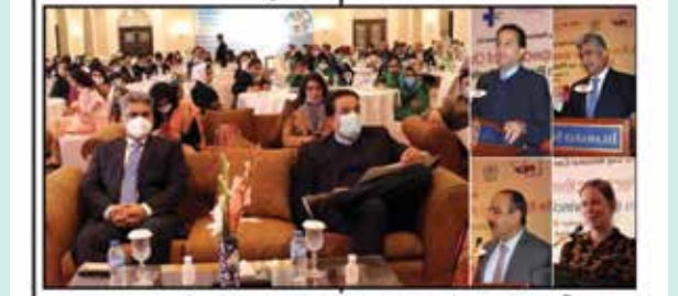
آر اينڊ ڊي ايف طرفان ڪورونائيل ڪانفرنس کي مقرر خطاب ڪندي

ڪانفرنس ۾ پيش جي پاڻي، معياري تعليم سميت ٻيون قرار داون منظور ڪيون ويون حیدرآباد (پريس رليز) سرچ اينڊ پوليسمنٹ فائونڈیشن حیدرآباد