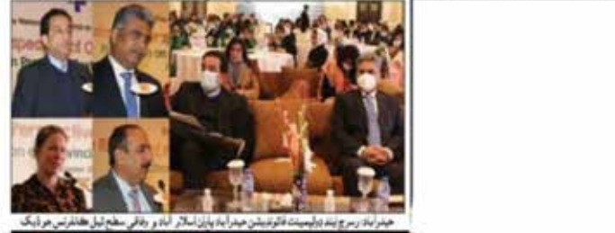
حیدرآباد سرچ اینڈ پولیسمنٹ فائونڈیشن حیدرآباد بارن اسلام آباد و وفاقی سطح لیل ڪانفرنس جو ڏيک

ڪوروناسبب پاڪستان پنهنجن ترجيحات تبديل ڪيون آهن. 10 ارب ڊالرن سان گڏ مختلف ملڪن دوست منصوبن شروع ۽ ڪيا آهن. ملڪن اسلام آباد (پريس رليز) سرچ اينڊ پوليسمنٹ فائونڈیشن حیدرآباد ماهريني تبديلين جا ٻارن تي اثر ۽ ملڪي 350 صفحو 02 بقايا 55