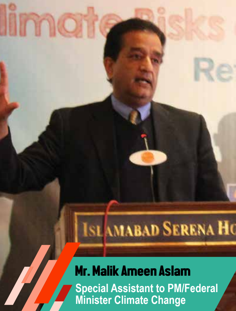
Mr. Malik Ameen Aslam

Special Assistant to PM/Federal Minister Climate Change