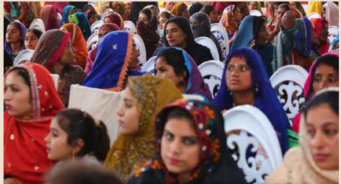
SHG Members in the program