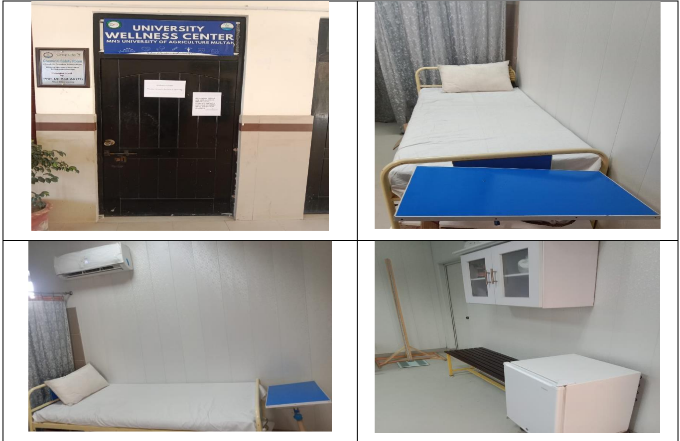
University Wellness Centre