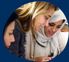
YBI members participating in different YBI events and trainings