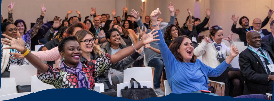
YBI's Global Network at YBI's Global Youth Entrepreneurship Summit 2022