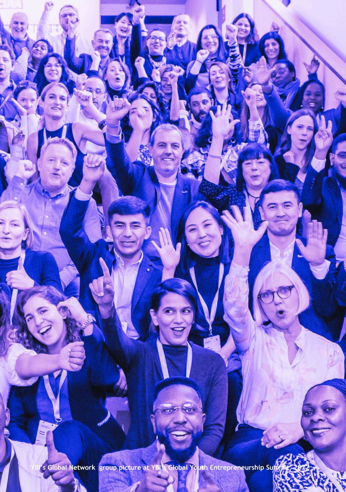
YBI's Global Network group picture at YBI's Global Youth Entrepreneurship Summit, 2022