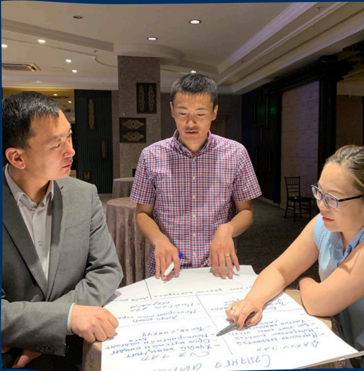
Development Solutions' team, YBI member, Mongolia

Through collaborative tools, we have learnt about the current state of and different perspectives on entrepreneurship and sustainability in different countries. We are very excited to be able to pilot this sustainability toolkit with our young entrepreneurs.