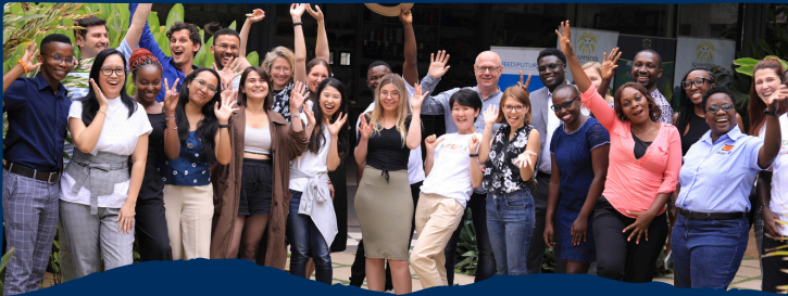
Group of YBI members at YBI's Community of Practice event, Kampala, 2023

We focus on building trusted relationships and enabling deeper connections, we understand that engagement and commitment follow when a trusting and open environment is provided.