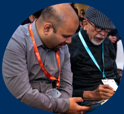
YBI members networking