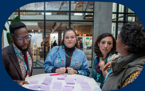
YBI members at YBI's Global Youth Entrepreneurship Summit, 2022