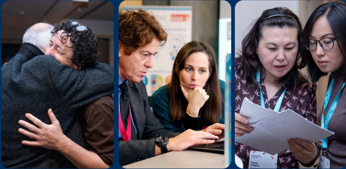
YBI members participating in different YBI events and trainings

Our network is built around connection, collaboration and content