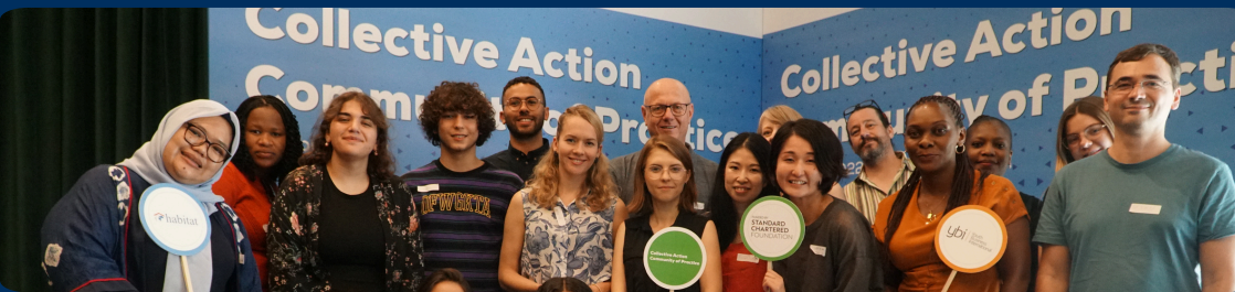
Group of YBI members at YBI's Community of Practice event, Turkey 2022

Established in 2000, our leadership of the only global youth entrepreneurship network gives us a unique perspective on youth entrepreneurship worldwide, and the ability to bring together our members from across the globe to connect, collaborate and exchange ideas, knowledge and insights.