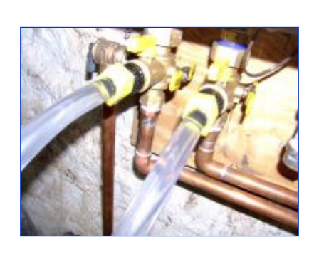
Valve drain caps removed, vinyl tubes with garden hose fittings screwed onto drain ports, water inlet/outlet valves closed, drain valves opened. Tube from transfer pump connected to cold water side, discharge from hot water side.