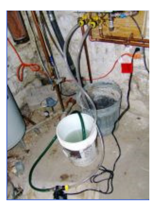
Clean vinegar added to bucket. Transfer pump recirculates vinegar to bucket.