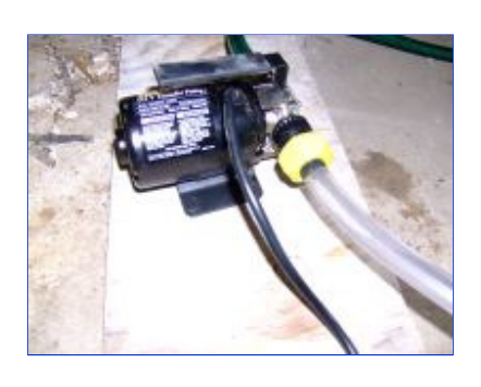
Wayne 115V transfer pump, $51 from Farm and Fleet.