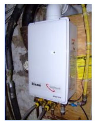
Rinnai tankless water heater warning code for lime deposits appears after 5 months