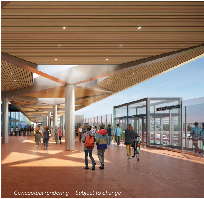
Conceptual rendering – Subject to change

Santa Clara Station, adjacent to the Santa Clara Caltrain Station and the future Gateway Crossings development, will be the end of the line station for VTA’s BART Phase II Extension. Unlike the three other stations, both the concourse and the platform will be at ground level. The station will include vehicle parking, bicycle facilities, and a connection to Caltrain, Capitol Corridor, Altamont Corridor Express, and several VTA bus lines through the existing Santa Clara pedestrian undercrossing.