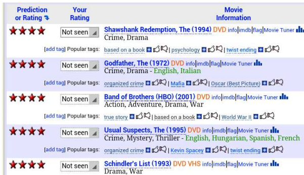
Figure 2: MovieLens: Movie recommendation website.

the user specifies a recommender [Recommender] that is harnessed by the system to produce k recommended items for user USER\_ID . To execute a recommendation query, RecDB invokes an operator, named Recommend , that is responsible for evaluating the user/item recommendation scores for all items unseen by the querying user. When a user asks for recommendation, the Recommend operator calculates the recommendation score RecScore , based on the selected recommendation algorithm (see Equation 2), for all candidates items and selects the top- k items with the highest RecScore value and returns them to the user. Recommend is integrated with other relational operators (e.g., Select , Project , Join ) in the query pipeline.