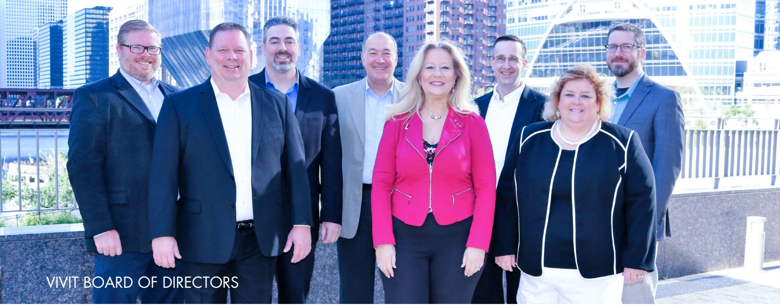
VIVIT BOARD OF DIRECTORS