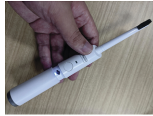
Figure 2. a smart toothbrush “SMASH” developed by NOVENINE Co., Ltd.