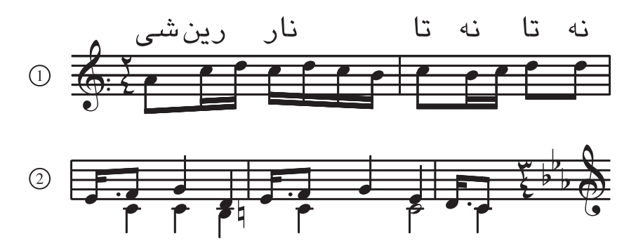
Figure 15-11. Examples of Specialized Music Layout

Similarly, format characters have been provided for other connecting structures. The characters U+1D175 MUSICAL SYMBOL BEGIN TIE, U+1D176 MUSICAL SYMBOL END TIE, U+1D177 MUSICAL SYMBOL BEGIN SLUR, U+1D178 MUSICAL SYMBOL END SLUR, U+1D179 MUSICAL SYMBOL BEGIN PHRASE, and U+1D17A MUSICAL SYMBOL END PHRASE indicate the extent of these features. Like beaming, these features are easily handled in an algorithmic fashion.