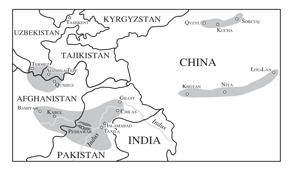
Figure 10-5. Geographical Extent of the Kharoshthi Script

The exact details of the origin of the Kharoshthi script remain obscure, but it is almost certainly related to Aramaic. The Kharoshthi script first appears in a fully developed form in the Aśokan inscriptions at Shahbazgarhi and Mansehra which have been dated to around 250 BCE. The script continued to be used in Gandhara and neighboring regions, sometimes alongside Brahmi, until around the third century CE, when it disappeared from its homeland. Kharoshthi was also used for official documents and epigraphs in the Central Asian cities of Khotan and Niya in the third and fourth centuries CE, and it appears to have survived in Kucha and neighboring areas along the Northern Silk Road until the seventh century. The Central Asian form of the script used during these later centuries is termed Formal Kharoshthi and was used to write both Gandhari and Tocharian B. Representation of Kharoshthi in the Unicode code charts uses forms based on manuscripts of the first century CE.