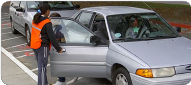
Richman Elementary School, Fullerton School District

Parents, school personnel, safety patrol or older students can serve as valets and open curb-side doors for students to enter and exit motor vehicles and remove bags or other items. This speeds up the drop-off and pick-up process by eliminating the need for the parents to get out of the vehicle and ensures students are directly accessing designated locations. These assistants should wear safety vests or belts, and the loading area should be designated by signs or paint and be located at the far end of the lane. It is best to have enough assistants to help load three or four vehicles at a time to speed up the process in a safe manner.