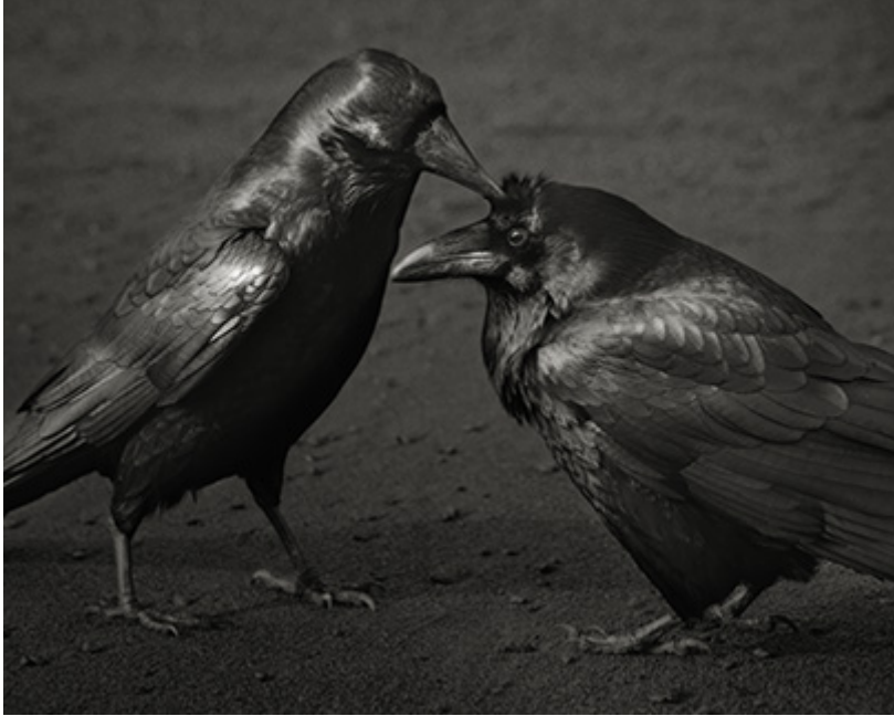
Odin's Cove #7