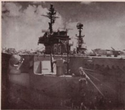
CAT SHOT —Flight Deck crewmen place the bridle on an A3B Skywarrior just prior to catapulting the huge bomber into the air.