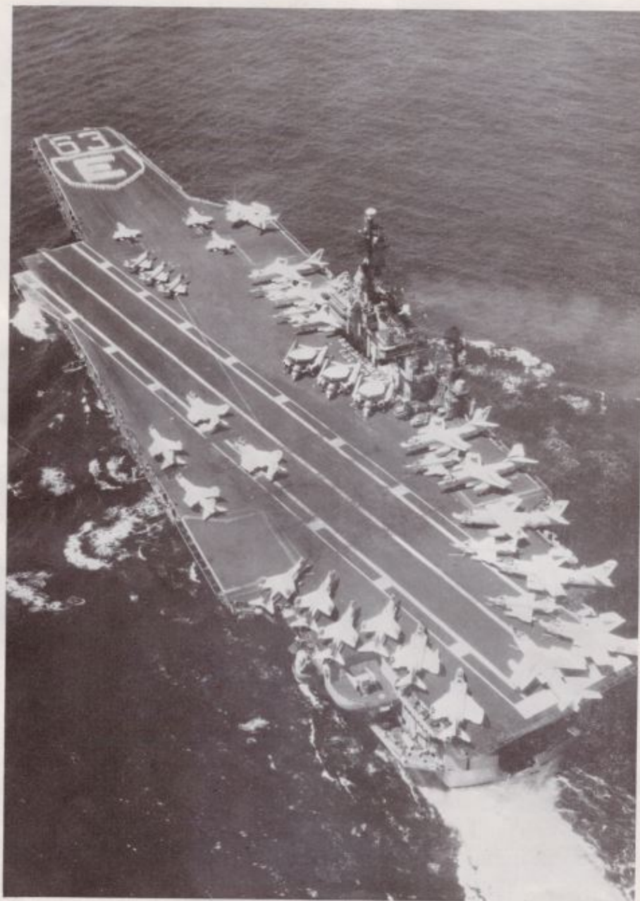
USS Kitty Hawk, CVA-63