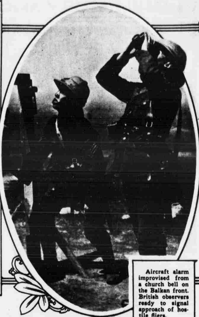
Aircraft alarm improvised from a church bell on the Balkan front. British observers ready to signal approach of hostile fliers.