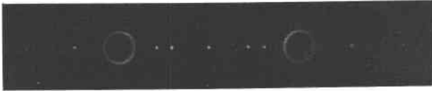
FIG. 2. Photograph of images of an illuminated pinhole as seen through an aragonite plate for seven selected positions of the crystal.

of their exact parallelism (in air), have zero intensity and contribute to the dark circles shown in Figs. 2 and 3. Each ray slightly inclined to those shown is doubly refracted and contributes light to point images. The points from the rays in a small cone which encloses the incident ray illustrated in Fig. 1 lie on the bright concentric circles, as can be demonstrated by Sylvester's construction. 2 Figure 2 shows the pinhole images for seven positions of the crystal. If the pinhole diameter is too large for the thickness of the crystal employed, the concentric rings are not resolved, and the pair is seen as a single ring. The light seen in either case has simply undergone double refraction. The rays which are truly conically refracted do not contribute to the image. The theory is correctly treated by Wooster 3 .