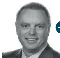
Horst Lichtner General Secretary, International Ice Hockey Federation

“The MESGO programme is not only a course where you learn a lot about organisations, laws, conflicts of interests, opportunities and threats; it is a long-term endeavour during which you can share problematic issues and learn more about solutions. Always practical, never boring, the MESGO gives you more than just tools; it offers you a wide perspective on the modern sports landscape.”