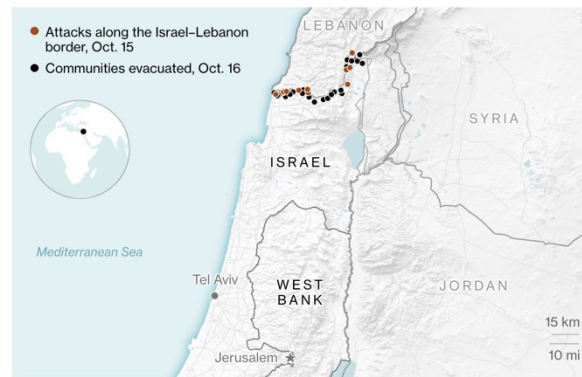
Sources: Israel Defense Forces; Institute for the Study of War and AEI's Critical Threats Project Note: Attacks against Israel include rocket attacks, anti-tank fires and small arms combats. The map shows the centroid for each evacuated community.

The move creates a 2-kilometer buffer zone after escalating attacks in Northern Israel, which the Israeli Army attributes to Lebanon-based Hezbollah