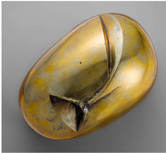
Constantin Brancusi The First Cry, c. 1914; cast 1917 brass Overall: 19.5 × 24.5 × 16 cm, 25 lb. (7 11/16 × 9 5/8 × 6 5/16 in., 11.3 kg) Art Gallery of Ontario Purchased with assistance from the Volunteer Committee Fund, 1981 81/142 Romanian, 1876 - 1957