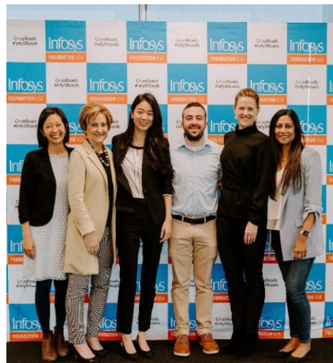
Infosys Foundation USA team, February 2023