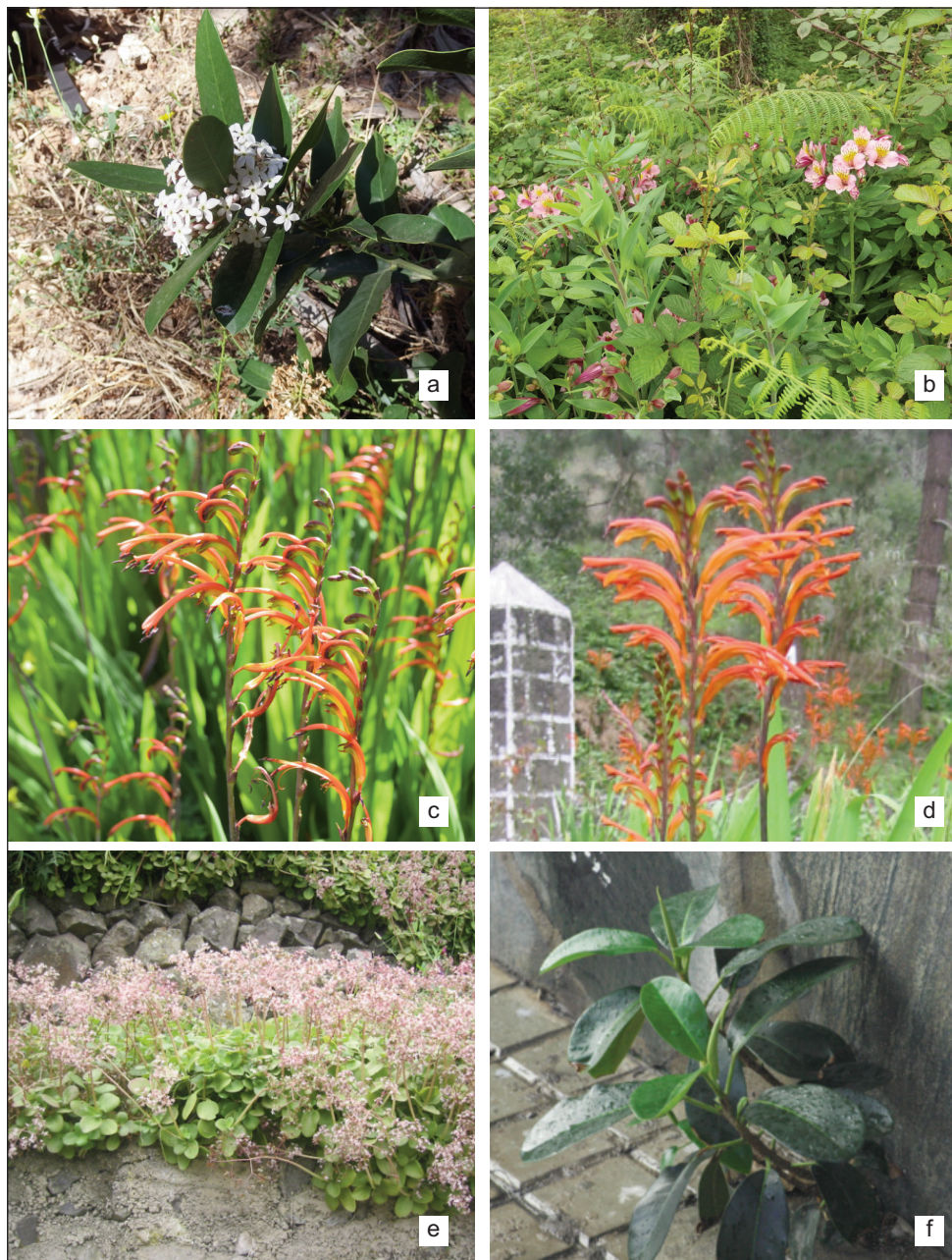
Fig. 1. a. Acokanthera oblongifolia , Telde, dry riverbed, April 2017, F. Verloove; b. Alstroemeria ligtu , Guía, roadside, April 2017, F. Verloove; c. Chasmanthe bicolor . Flower details, Valleseco, March 2018, Á. Marrero; d. Chasmanthe floribunda , Valleseco, February 2006, M. Salas Pascual; e. Crassula multicava , Valleseco, March 2013, M. Salas Pascual; f. Ficus rubiginosa . Las Palmas de Gran Canaria (Escaleritas), foot of wall, November 2012, Á. Marrero.