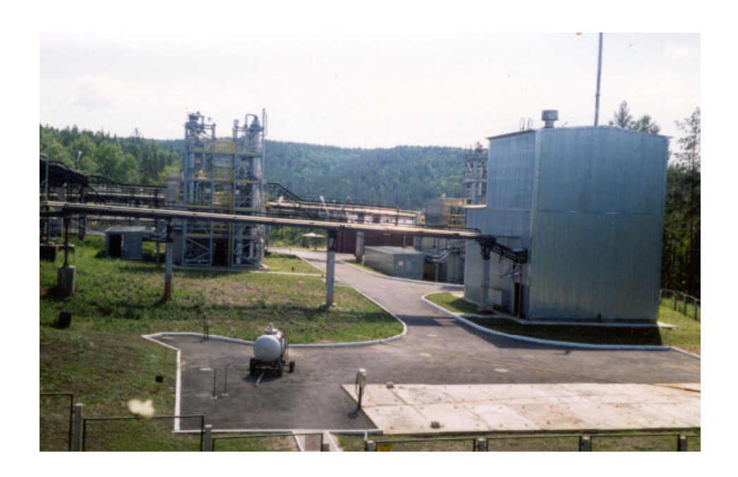
Ground View of the Heptyl Fuel Disposition System