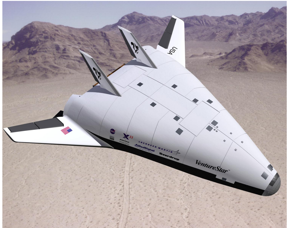
Figure 1: Exterior Illustration of the Planned X-33 Vehicle