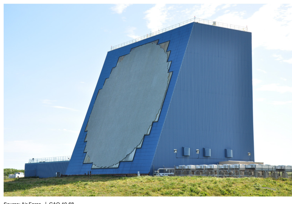
Figure 1: The Cobra Dane Radar