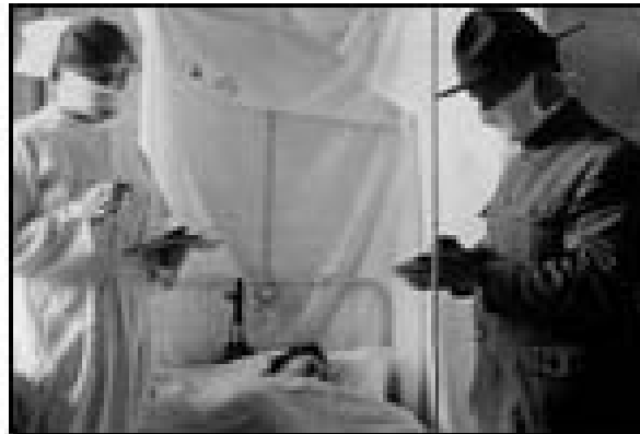
Military physicians were baffled by the mysterious illness that was striking young, healthy soldiers.