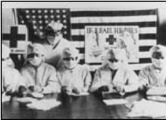
The influenza epidemic taxed the resources of The Red Cross.