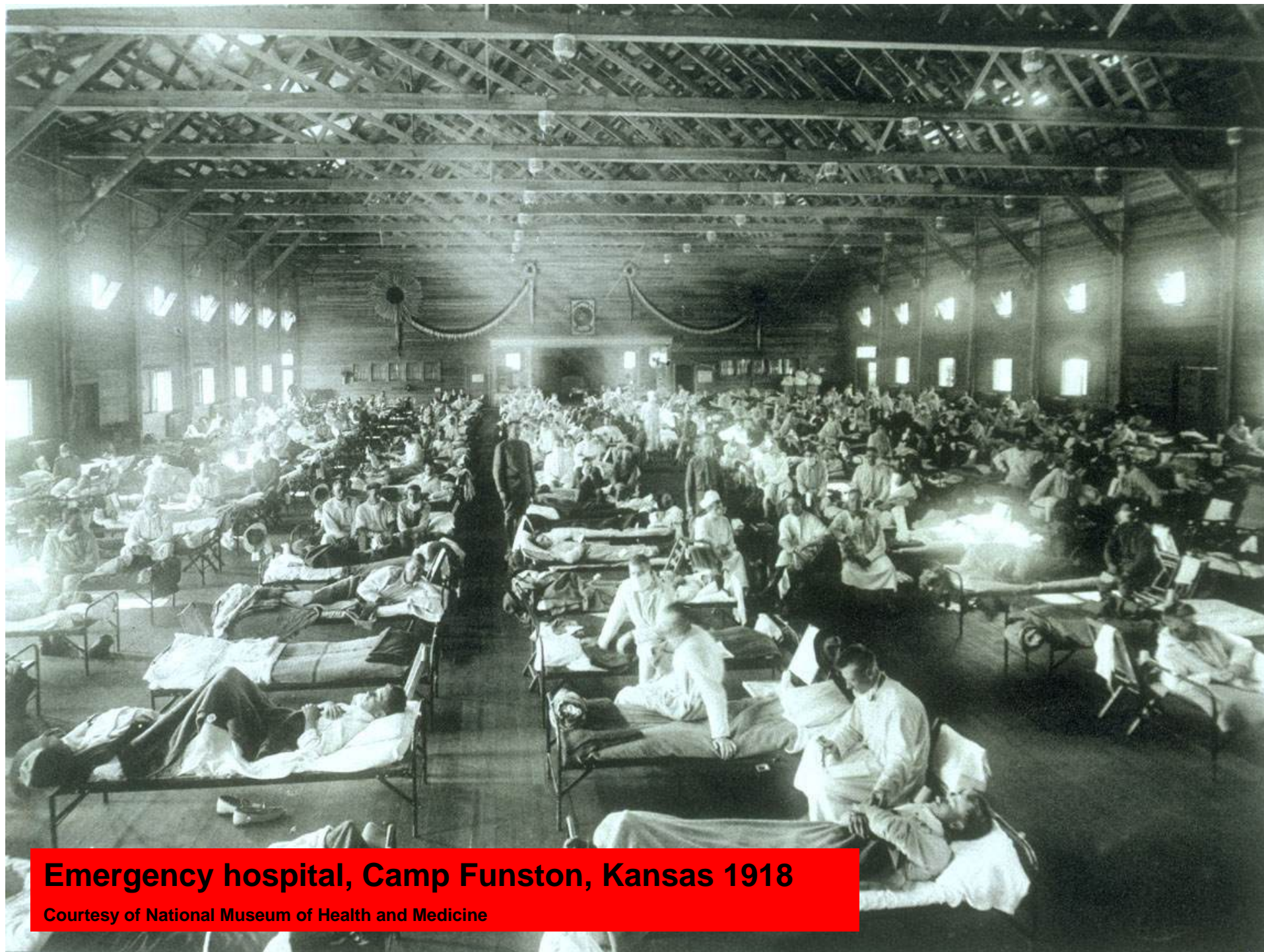
Emergency hospital, Camp Funston, Kansas 1918