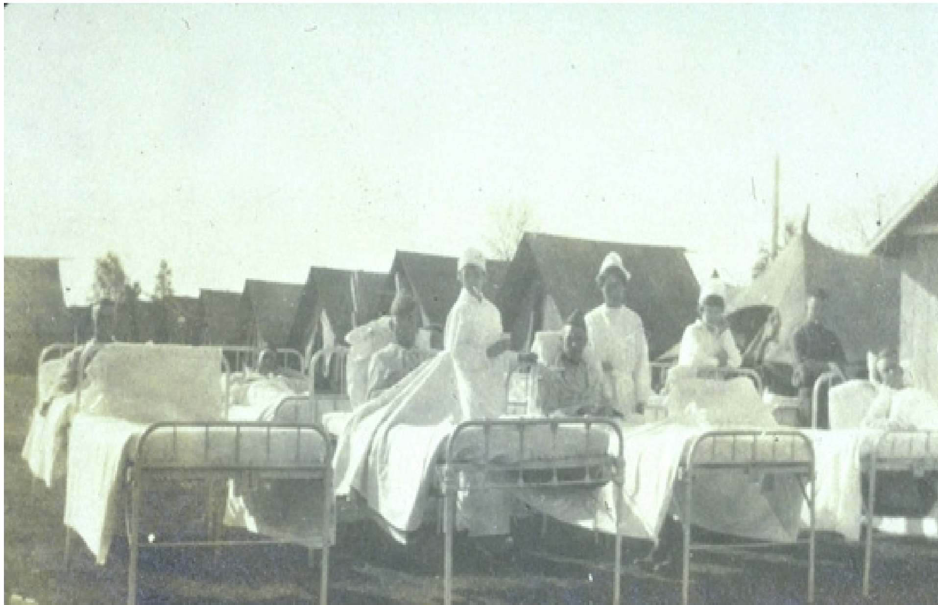
Patients convalescing , 1918