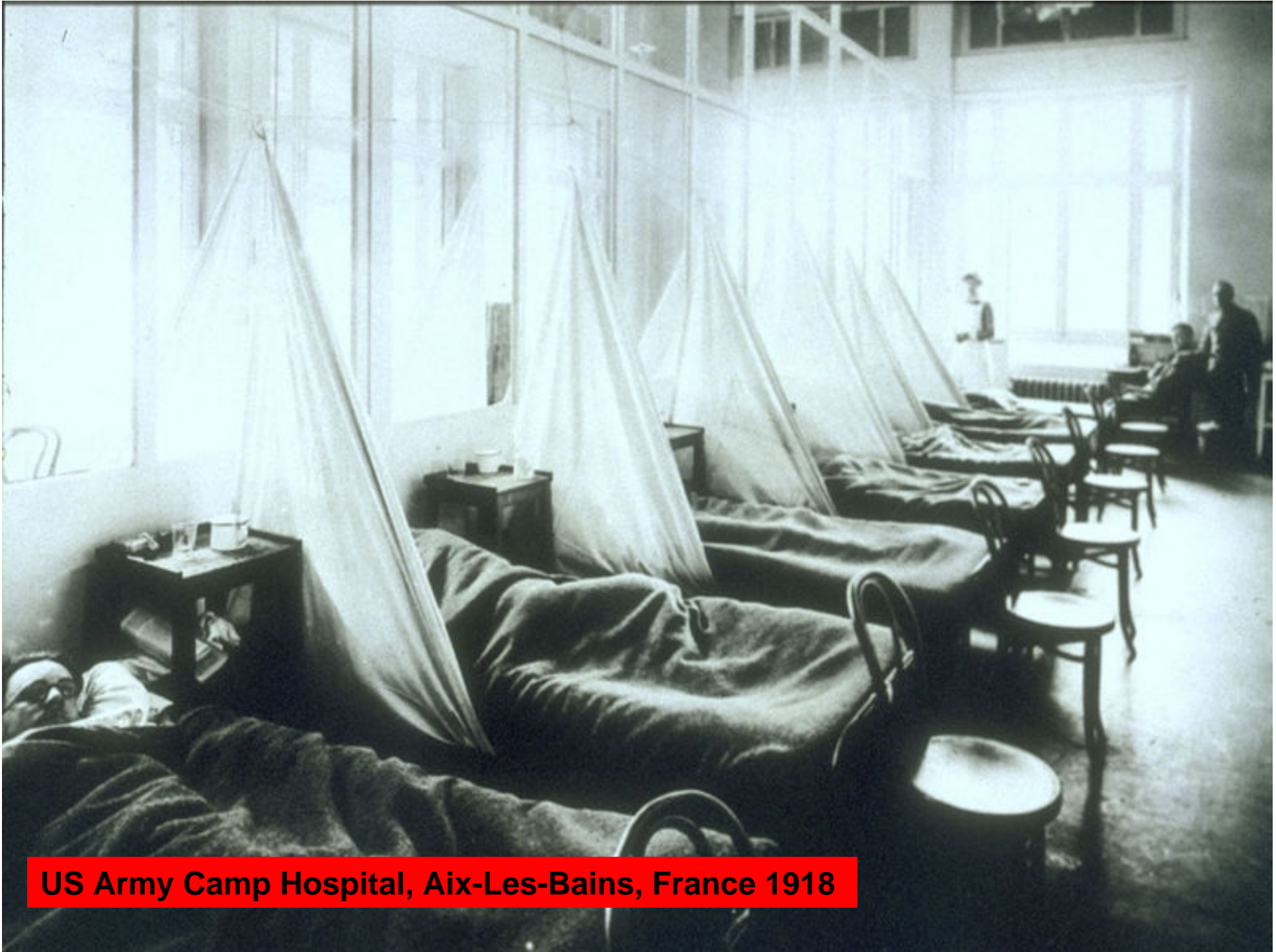
US Army Camp Hospital, Aix-Les-Bains, France 1918