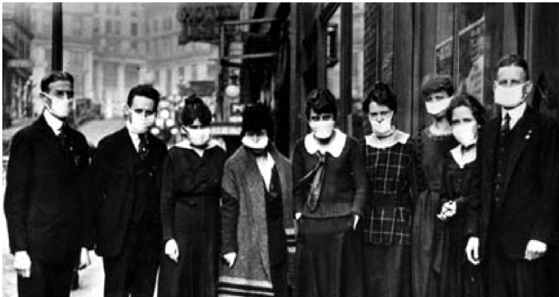
Employees of Stewart & Holmes Wholesale Drug Co. Seattle, 1918