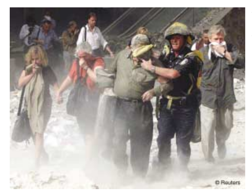
Survivors walk away from the World Trade Center site in New York City after two airliners crashed into the towers on September 11, 2001.