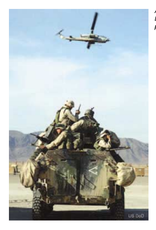
At the US Marine Corps Base in Kandahar, Afghanistan, Marines on a Light Armored Vehicle who are supporting Operation Enduring Freedom prepare to go on patrol. An AH1W Super Cobra helicopter flies overhead.

• The G-20 and IMF member countries have agreed to make public the list of terrorists whose assets are subject to freezing, and the amount of assets frozen.