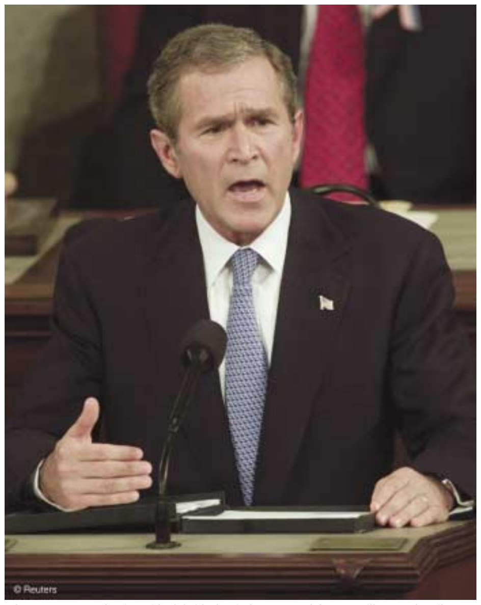
"Our war on terror begins with al-Qaida, but it does not end there. It will not end until every terrorist group of global reach has been found, stopped, and defeated." President George W. Bush address to Joint Session of Congress 20 September 2001