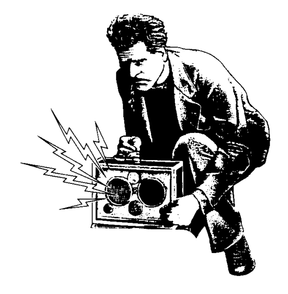
"Confront your fears."

It requires that members of the clergy, preachers, teachers, and other foreign citizen representatives of foreign organization preach, administer religious ordinances, or practice other canonical activities 'only in those religious organizations which invited them to Ukraine and with official approval of the governmental body that registered the statues and the articles of the pertinent religious organization'" (United States Policies in Support of Religious Freedom--1997, p. 51. See Russian Federation Unit 3a--Russian Orthodox Religious History for the similar Russian Orthodox Protection Law of 1997).