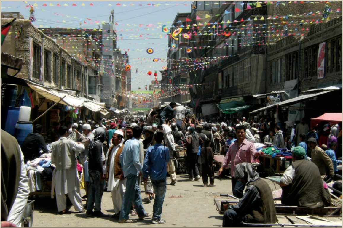
Afghans shopping , getting food, chatting, and resting in Kabul's busy Mandawi Market.