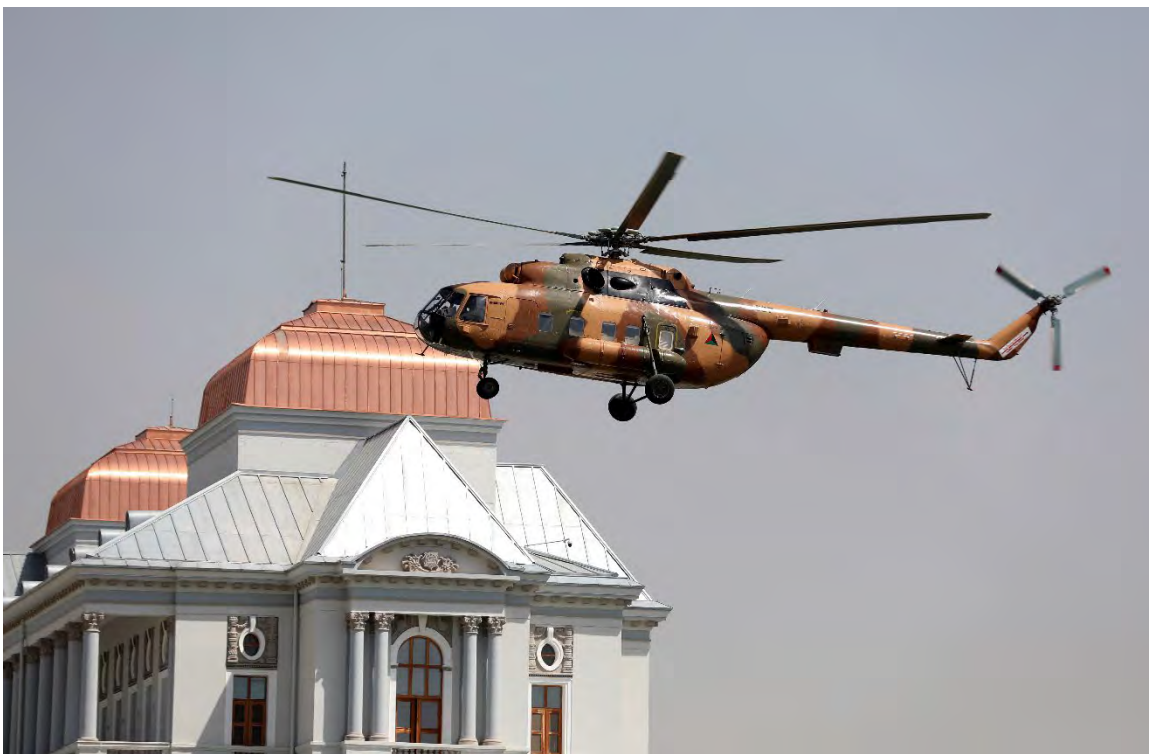
A helicopter carrying President Ashraf Ghani lands at the Darul Aman Palace in Kabul, Afghanistan, Monday, August 2, 2021.