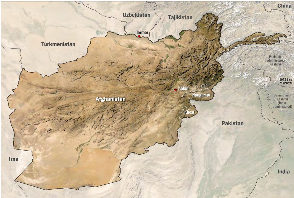
Figure 2: Map of President Ghani's Reported Evacuation Options

Source: Former senior Afghan official, SIGAR interview; “Ex-Afghan President Says Decision to Flee Kabul was Made in ‘Minutes,’” France 24 , December 30, 2021; CBS News, “Face the Nation,” December 19, 2021.