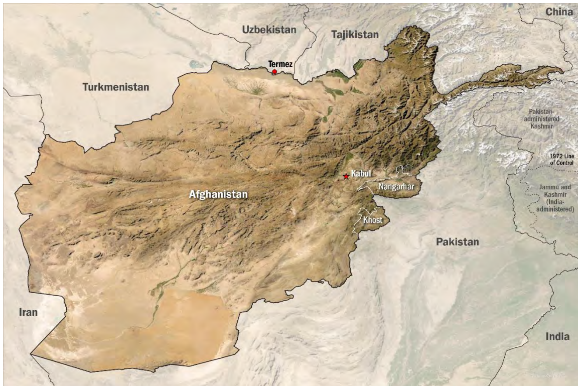
Figure 4: Map of President Ghani's Reported Evacuation Options

Source: Former senior Afghan official, SIGAR interview; "Ex-Afghan President Says Decision to Flee Kabul was Made in 'Minutes,'" France 24 , December 30, 2021; CBS News, "Face the Nation," December 19, 2021, https://www.youtube.com/watch?v=q5t8Khew004 .