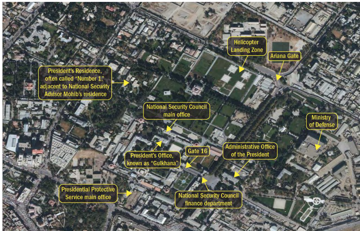
Figure 1: The Presidential Palace in Kabul