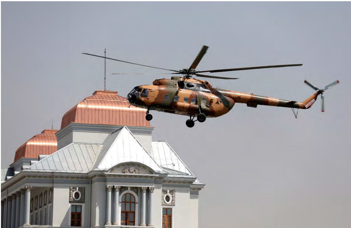
Caption: A helicopter carrying President Ashraf Ghani lands at the Darul Aman Palace in Kabul, Afghanistan, Monday, Aug. 2, 2021.