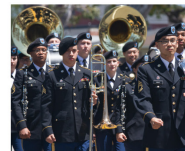
Bands and ceremonial units