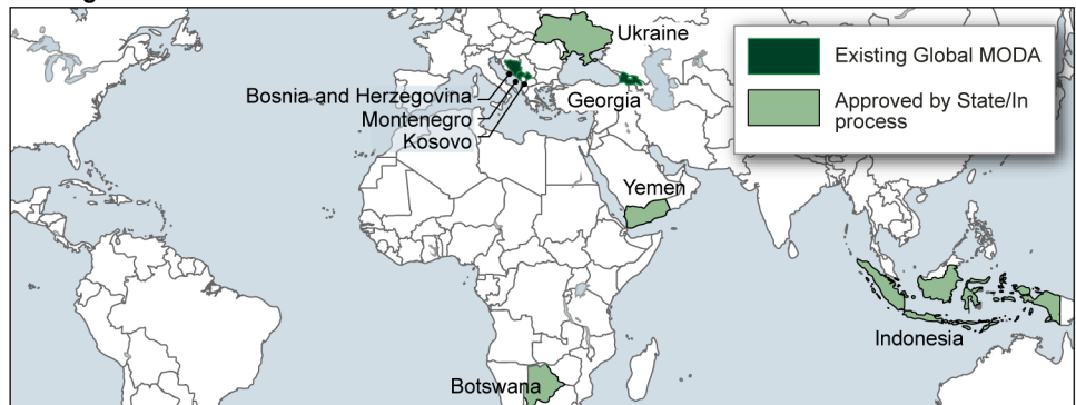
Source: GAO from Department of Defense data; Map Resources (map). | GAO-15-279

DOD has met most but not all legislative requirements for the MODA program. As required by the National Defense Authorization Act (NDAA) for Fiscal Year 2012, DOD obtained concurrence on its proposed deployments from the Department of State (State). DOD's most recent annual report to Congress included 4 of the 6 required elements, but did not include information on the cost or duration of each Global MODA deployment, which could help Congress assess the value of the program in relation to other capacity-building efforts (see figure). Additionally, DOD has not provided information on the program's performance, such as linking actual performance to goals. Although DOD is not required by law to include this information, GAO has previously reported that such information can be useful to decision makers. Finally, DOD has not updated the policy for the program as required in the NDAA for Fiscal Year 2014.