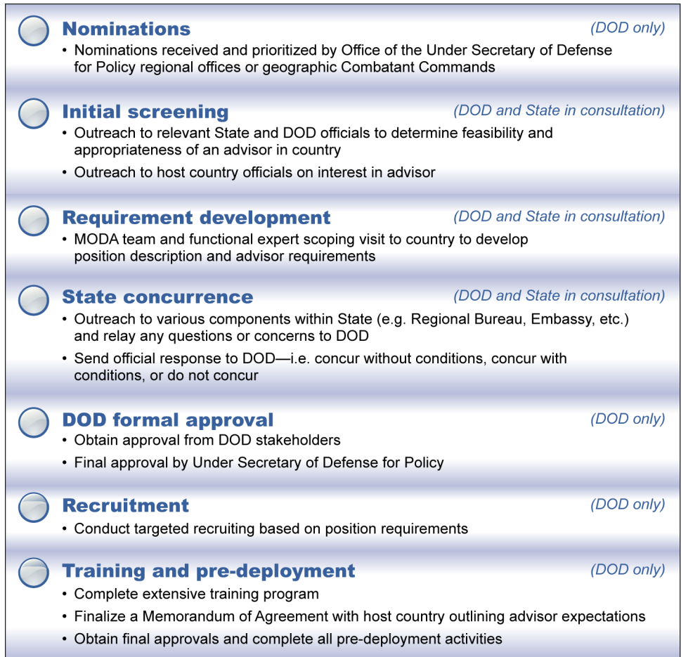
Figure 1: Process for Selecting a Location for and Deploying a Global Ministry of Defense Advisor

Source: GAO from Department of Defense and State Department data. | GAO-15-279