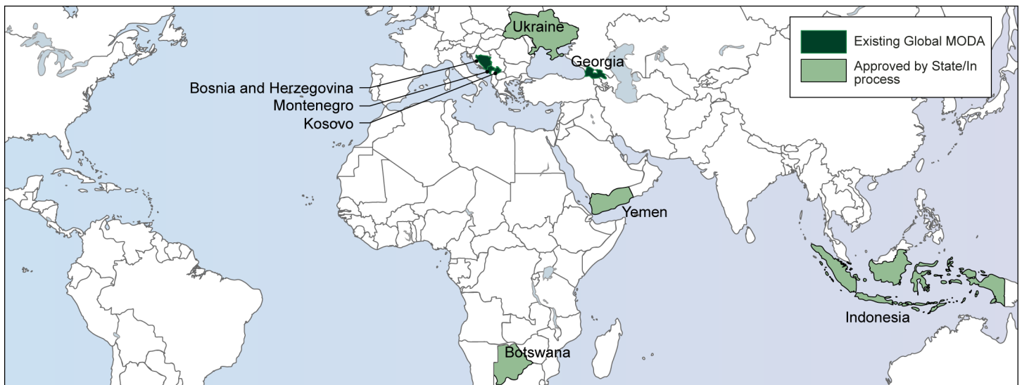
Figure 2: Existing and Planned Global Ministry of Defense Advisors Placements, as of December 2014

GAO-15-279