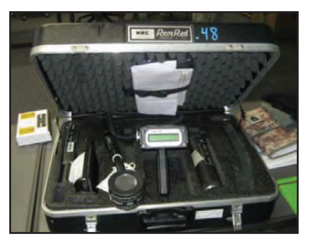
Figure 1-9. The ADM-300, an all-in-one multifunctional detection system for rapid response to suspected radiation hazards. ADM-300s are rugged, reliable, and designed for use in harsh environments. The ADM-300 will detect, measure, and digitally display both dose and dose rate levels of radiation from 10 \mu R/hr to 10,000 R/hr and beta audio alert and aids in directing radiation from 10 \mu R/hr to 5 R/hr (0.1 \mu Sv/hr to 0.05 Sv/hr).

CM-2011-03-07-01-O-02: Radioactive contamination screening levels changed frequently.