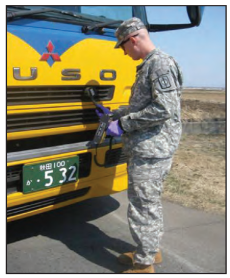
Figure 1-10. A 71st Chemical Company Soldier using the ADM-300 to detect and measure radiation

DOTMLPF Implications. Training: Conduct more deliberate unit and regional joint training for CM/FCM missions using the equipment required for the scenario(s) to make Soldiers knowledgeable about units of measurement. Provide MTTs from the USACBRNS to train Soldiers on government-furnished equipment (GFE) and COTS equipment when feasible. Incorporate distant-learning training and refer to the training support packages located at the CBRN Knowledge Network.