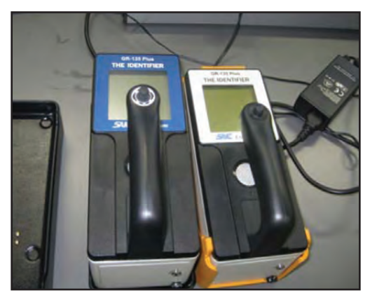
Figure 1-8. GR-135 IdentiFINDER. The IdentiFINDER is automatically in the search and data mode. It displays simultaneously. Should high levels of radiation be detected, the unit gives an eyes-free audio alert to the operator to the location of the source. If radiation levels are high, the unit tells the operator to back off.