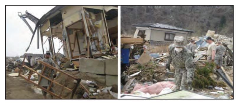
Figure 1-11. Soldiers of the 71st Chemical Company volunteered to provide humanitarian assistance/disaster relief support in Hachinohe and Noda Village. Pictured here are Soldiers conducting disaster cleanup after the earthquake and subsequent tsunami that occurred in Japan on 11 March 2011.

capitalize on joint CM training opportunities. (JP 3-41, Chemical , Biological , Radiological , Nuclear , and High-Yield Explosives Consequence Management ; and FM 3-11.21)