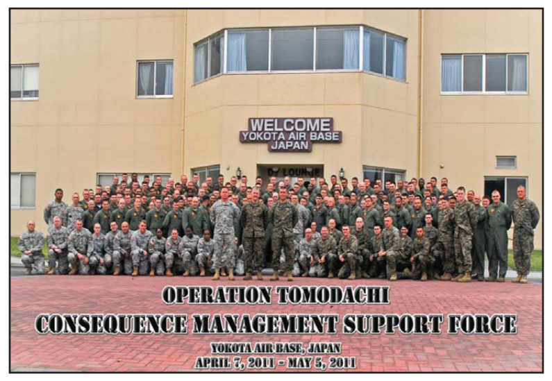
Figure 1-3. Members of the U.S. Army, Pacific Command Chemical, Biological, Radiological, Nuclear, and High Yield Explosives Division; 71st Chemical Company; and joint members of the consequence management support force

The lessons learned process (LLP) is a deliberate and systematic process for collecting and analyzing field data and disseminating, integrating, and archiving observations, insights, and lessons collected from Army operations and training events. Information gathering will be integrated into DOTMLPF (doctrine, organization, training, materiel, leadership and education, personnel, and facilities); research (industry and academia); development; acquisition; and planning activities in order to sustain, enhance, and increase the Army's preparedness to conduct current and future operations. The process is solution-oriented. It is designed to support organizations at all levels of command and staff and can be adapted for use in all operations, to include combat, training, maintenance, installation support, experiments, and equipment fielding. Observations, insights, and lessons do not constitute lessons learned without changing individual, unit, or Army behavior, which is accomplished through the application of the LLP.