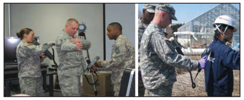
Figure 1-6. While in Misawa and Yokota Air Bases, Soldiers of the 71st Chemical Company received hands-on training (left) on the use of Air Force CBRN monitoring equipment (such as the ADM-300 shown here) before going out to do actual personnel monitoring of drivers entering the bases (right).