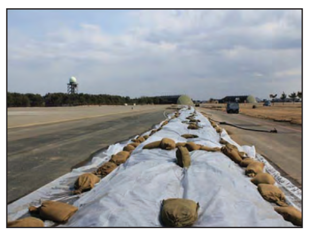
Figure 1-7. If radiological levels are remonitored and unable to be brought under published threshold levels, the aircraft, vehicle, or equipment will be transported to the hot cargo pad (above) for isotope identification, further radiological analysis, and gross decontamination.