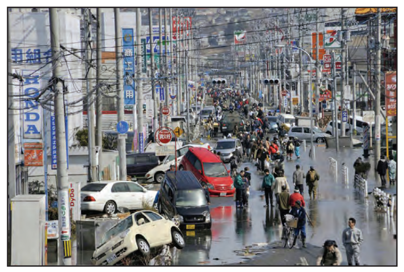
Figure 1-4. A flooded street in Japan after the earthquake and tsunami in March 2011