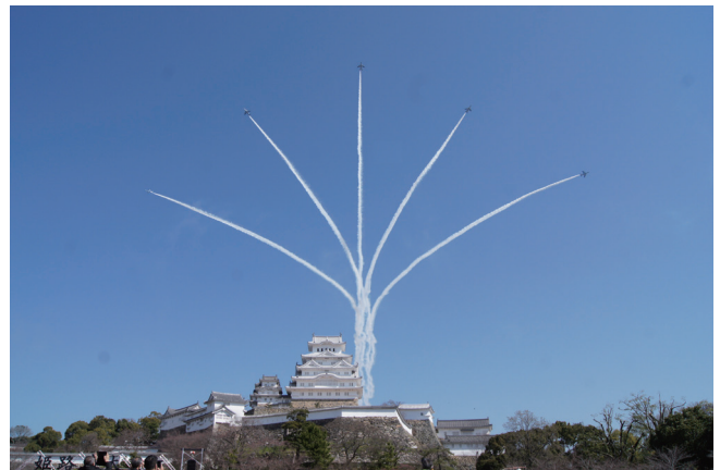
Blue Impulse flying over Himeji Castle at the "Ceremony Marking the Completion of the Preservation and Restoration Project for the Main Keep of Himeji Castle." (March 26, 2015)

opportunities for local small and medium sized enterprises to receive orders, while taking efficiency into account, by such measures as the promotion of separated/divided ordering 2 and the securing of competition amongst companies within the same qualification and grade divisions 3 .