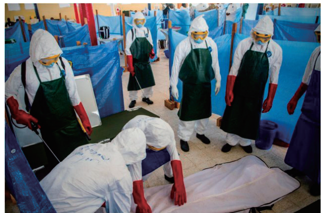
U.S. Forces training for health workers

roughly 2,900 personnel. In Liberia, the U.S. Forces are engaged mainly in the construction of treatment facilities, the establishment of facilities to train health workers, and transport. In October 2014, the United Kingdom announced its intention to deploy units primarily to Sierra Leone. In December 2014, the number of deployed U.K. units reached roughly 800 personnel. The British Armed Forces are engaged in the construction of treatment facilities, the provision of training supports for health workers, and the transport of personnel by helicopter. In addition, France, Germany, China, and other countries dispatched military personnel in order to contain Ebola. These forces are involved mainly in medical activities, the transport of medical supplies, and the education and training of local public health officials, with the purpose of providing effective supports for the local containment effort. While the WHO declared Liberia free of Ebola in May 2015, these efforts of the international community are still ongoing.