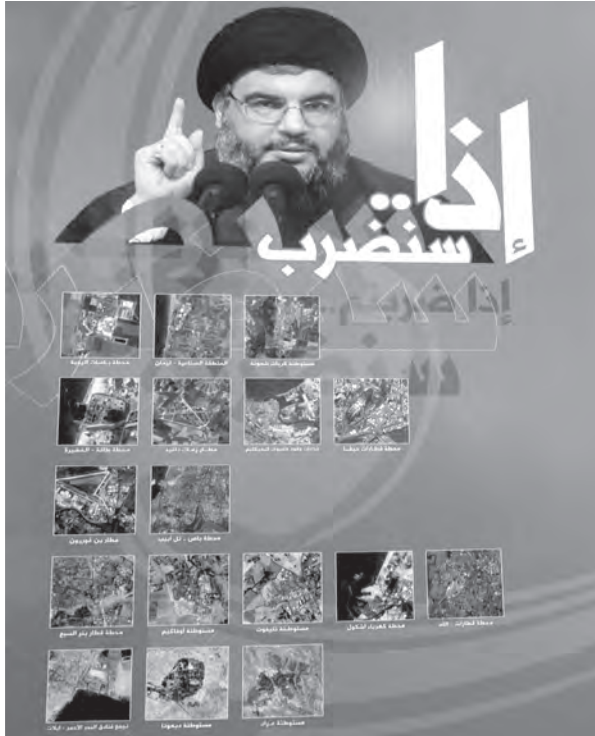
Figure 1. Propaganda Poster in the Mleeta Museum, “If you strike . . . we will strike.” 72

Mleeta Resistance Museum built by Hezbollah in the South after the 2006 war. The Museum itself is filled with messages of deterrence such as maps of Israeli locations in the range of Hezbollah’s missiles. (See Figure 1.)