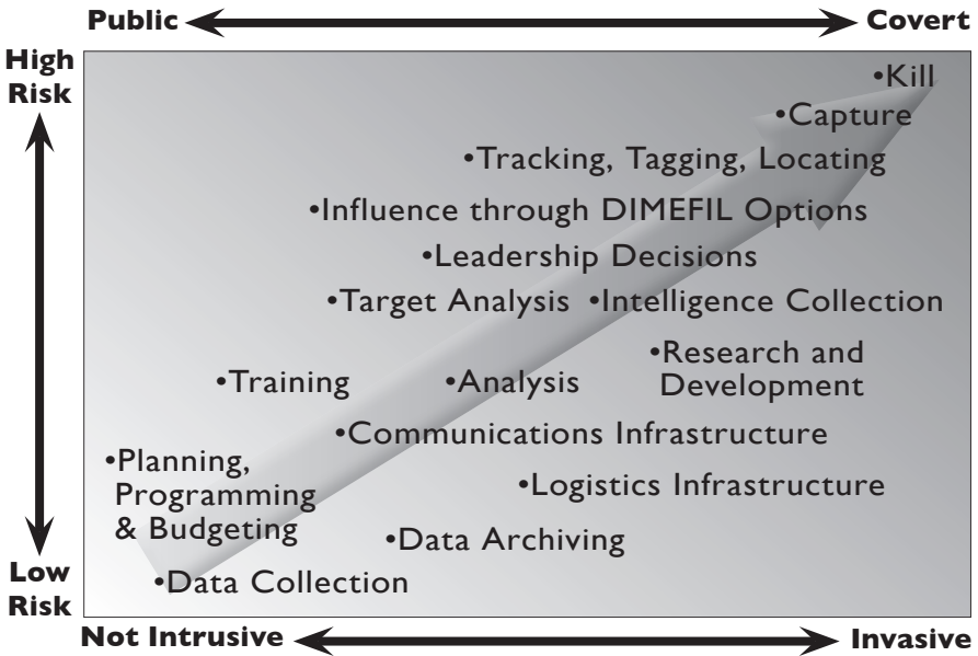
Figure 1. Spectrum of Manhunting-Related Activities

Next on the spectrum one finds infrastructure and logistics—preparatory actions that must take place to enable any subsequent action—conducted in those regions determined most likely to require manhunting activities. Personnel selection, training, and administration of a manhunting force would also fall into this area. Up to this point on the manhunting spectrum, the government has not yet targeted any individuals or human networks.