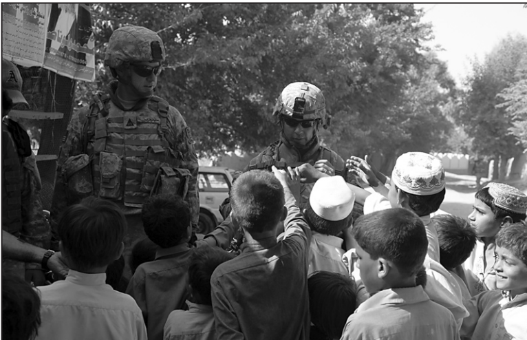
Afghanistan, 2009. Interaction with the local population plays an important role in counter-network operations. Considering every citizen a sensor, an informed, alert civilian population can provide important tip-off information to locate key targets.

Fourth, manhunting is a people- and process-oriented endeavor. In successful operations, technology played only a supporting role. 7 Similarly, the most effective manhunting operations are centered on people with the requisite skills, participating in a mutually understood process to achieve a clearly articulated goal. In some cases, while technology has enhanced this ability, technology has not been the most significant contributor to manhunting; even Predator unmanned aerial vehicles (UAVs) and Hellfire missiles are merely the respective investigative and lethal arms of a distributed organization, comprising people with a clear process, cued by intelligence. The primary role played by technology has been to extend the span and scope of sensory, mobility, and firepower capabilities and speed communications for the manhunting team.