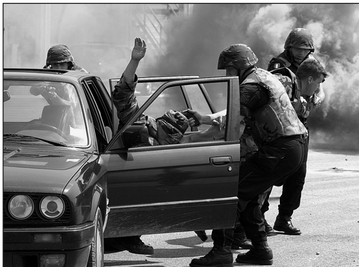
Aviano AB, Italy. Italian Carabinieri (paramilitary police) seize a high value target (HVT) during a joint training exercise with U.S. Air Force security police. The ability to conduct operations in concert with allied internal security forces will be crucial to counter-network and manhunting operations in semipermissive environments.

When conducting counter-network operations on a global scale, it is necessary to carry out activities at tactical, operational, and strategic levels. At the tactical level, it is important to organize forces so that they are best aligned to engage and subdue the enemy. The operational level combines tactical actions into campaigns to defeat networks. The strategic level of a manhunting organization is responsible for orchestrating all of the elements of national power against the enemy, with impact spanning a period of years or decades. Strategic manhunting capabilities must be aligned at three levels: a) departmental or interagency, b) national, and c) international organizations must coordinate and deconflict multiple efforts, bringing each organization's capabilities to bear for best advantage.