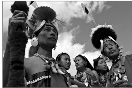
Yimchungru Naga tribe members in traditional dress at the Hornbill Festival in Kisama, Nagaland, in May 2005.

In 1951, Phizo organized what he called a “plebiscite” on the issue of independence. He claimed to have visited all the villages, obtained the signatures or thumb impressions of the people, and administered them