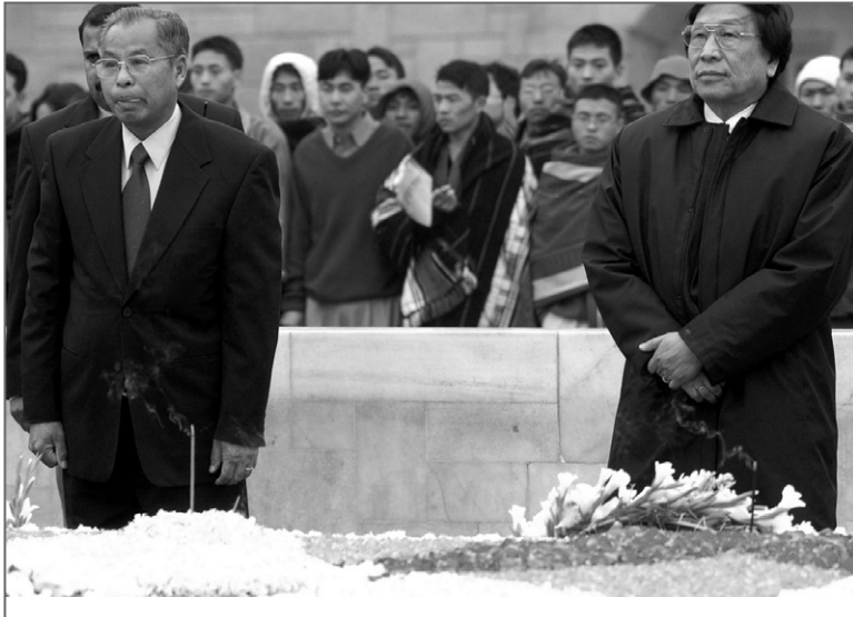
General Secretary of the NSCN Thuingaleng Muivah (R) and NSCN Chairman Isak Chisi Swu (L) pay tribute to Mahatma Gandhi at his mausoleum in New Delhi, 9 January 2003. The two exiled separatist leaders were due to hold peace talks in the Indian capital.

Ironically, resentment is building among the Naga tribes of Nagaland over the Tangkhul dominance of the NSCN (IM). Being a Tangkhul, Muivah