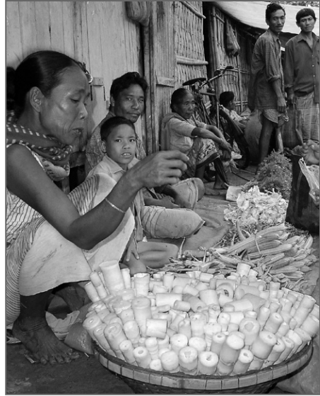
August 2001, a tribal woman sells bamboo shoots, a local delicacy available year-round, in Mandai market 28 kms from Agartala, the capital of Tripura. Tripura’s rich forests abound with many varieties of bamboo used by the tribal community for many purposes including food.

The improved security scenario in Tripura is reflected in countries like China, Japan, Germany, and Thailand showing interest in investing or in providing financial assistance to Tripura. The Chief Minister of Tripura, Manik Sarkar, recently claimed that China had agreed to provide technology to set up bamboo-based industries and livelihood opportunities to farmers and tribal people and that the Japan Bank for International Cooperation (JBIC) was going to provide Rs. 3.66 billion as a soft loan to the State. Besides, Germany was giving Rs. 1.12 billion for ecological conservation projects and the development of livelihood resources for tribals and other forest dwellers. A Thai delegation, besides, had expressed interest in investing in tourism, infrastructure, food processing, and agro-based industries. 51