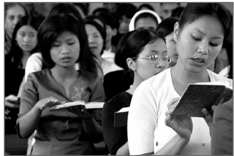
November 2003, Mizo people sing at a church service in Aizwal in mainly Christian Mizoram state.

The Memorandum of Settlement between the Government of India and the Mizo National Front involved a power-sharing arrangement between the Congress, which was then ruling Mizoram, and the Mizo National Front and ensured the grant of full statehood to Mizoram. The Mizo National Front agreed to abjure violence and desist from supporting any armed group against the Government of India. The Government agreed to rehabilitate the Mizo cadres and conceded the Mizos' right to adopt "any one or more languages in use in the state" as its official language. A special provision was also added in the Constitution of India as Article 371G which stated that