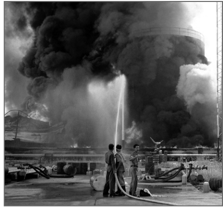
August 1998, firemen try to extinguish a blaze at the Indian Oil Corporation fuel depot in Nagaom, Assam, after an attack by ULFA militants.