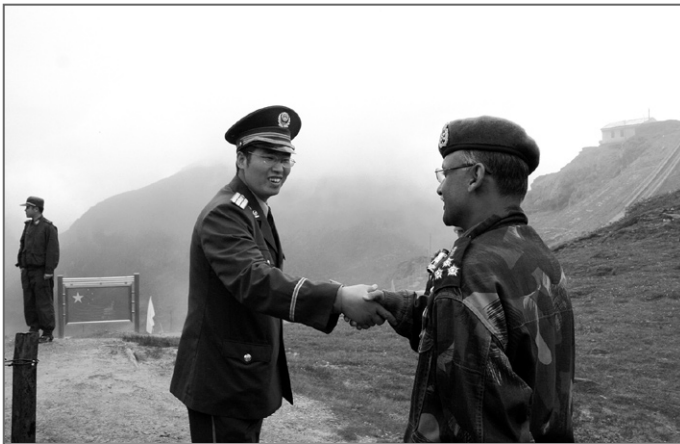
A Chinese army officer (L) exchanges greetings with his Indian counterpart at Nathu La pass on the border between Sikkim and Tibet in July 2006. Formal trading was due to begin at the 4,545-meter pass along the historic Silk Route.

Meanwhile, the Government of India has embarked on a program for an “integrated and holistic development of the region.” It is true that the northeast has intrinsic bottlenecks: the area is geographically remote, the terrain is difficult, infrastructure is poor, capital formation is weak, and the spread of technology is slow. However, the area has its positives: huge deposits of minerals, abundant natural resources, potential for agro-forestry and horticultural sectors including bamboo plantations, vast water resources, proximity to Southeast Asia’s fast growing economies, a highly literate population, rich heritage of handicrafts, and a strong community spirit. The effort is to develop these potentials. A Vision Northeastern Region (NER) 2020 for the northeast has been drawn up. The plan aims to develop all sectors of the region’s economy by exploiting its resource potential. It