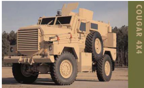
Figure 2. Cougar 4x4

Cougar. In April 2004, MCSC awarded a sole-source contract to FPI for 28 Cougars. The Cougar is a hardened engineering vehicle that provides protection against armor-piercing rounds and high-explosive projectiles. The Cougar is available in two configurations: a 4x4 design (see Figure 2) and 6x6 design (see Figure 3). Both designs are used for ordnance disposal, communications, command and control, and leading convoy missions. Similar to the Buffalo, the Cougar has an armored v-shaped hull that deflects outward the blast from an improvised explosive device, increasing the chance of survival for those inside the vehicle.