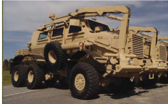
Figure 1. Buffalo

TACOM LCMC and MCSC contracting practices followed for procuring the Buffalo.