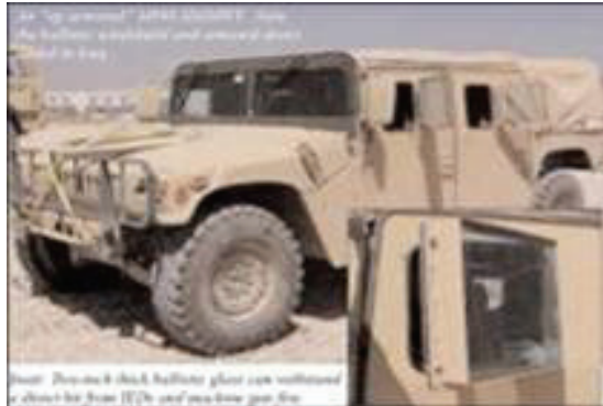
Figure 4. Armored HMMWV

*This contract also procured 102,698 armor kits; the value of the kits is included in the contract price column above. The Army may increase the quantity ordered on this contract through option year 2007 and, if exercised, 2008.