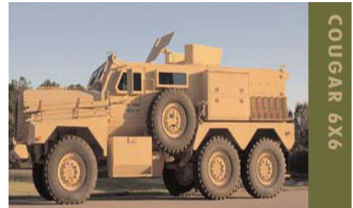
Figure 3. Cougar 6x6

JERRV. MCSC awarded three sole-source contracts to FPI for the JERRV. In May 2005, MCSC became the procuring service for the Cougar for all military services, and the Cougar became a joint service vehicle known as the JERRV. In May 2005, MCSC awarded a sole-source contract to FPI for 122 JERRVs. In May 2006, MCSC awarded a second sole-source contract to FPI for 79 JERRVs. In mid-November 2006, MCSC awarded a third sole-source contract to FPI for 200 JERRVs as part of the MRAP program. MCSC also procured 80 Buffalos under this contract. During our visit in late November 2006, a program official stated that MCSC planned to compete future contracts for the JERRV.