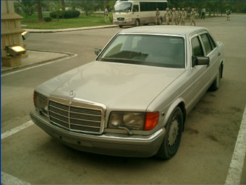
Mercedes sedan (Armored)