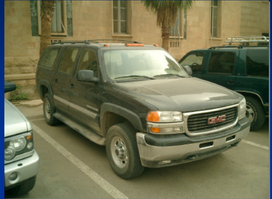
GMC Suburban (Unarmored)