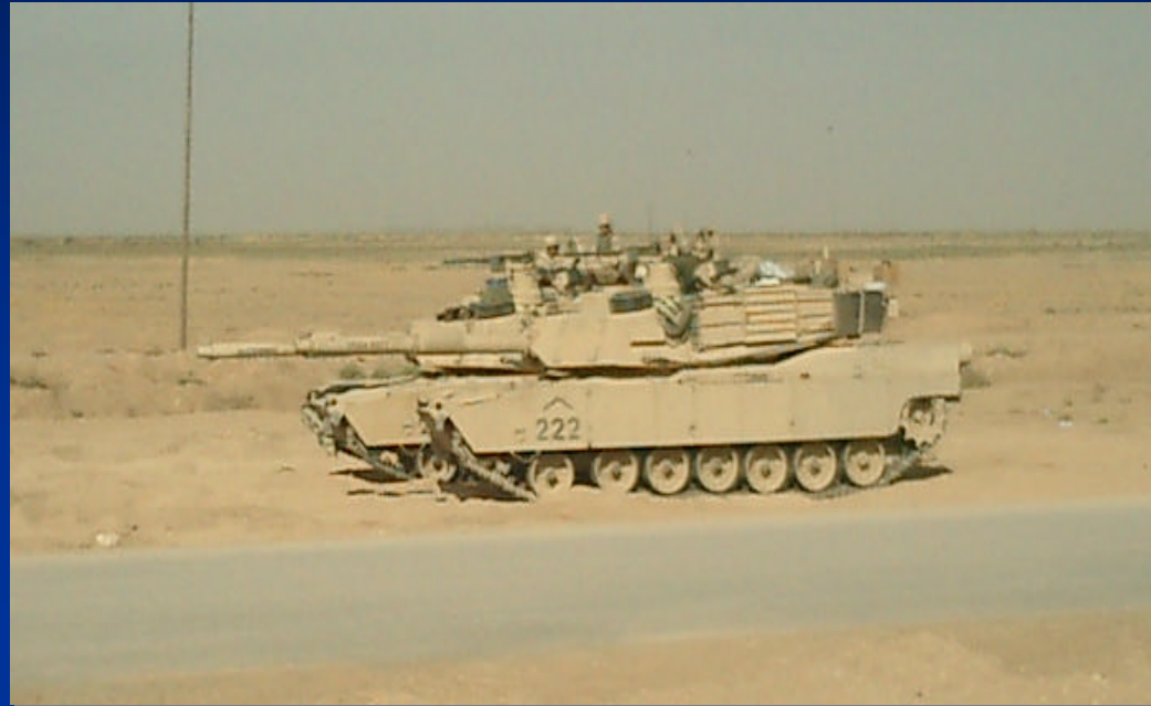
M-1A2 Main Battle Tank (Armored)