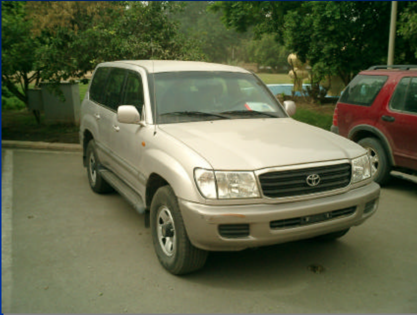
Toyota Land Cruiser (Armored)