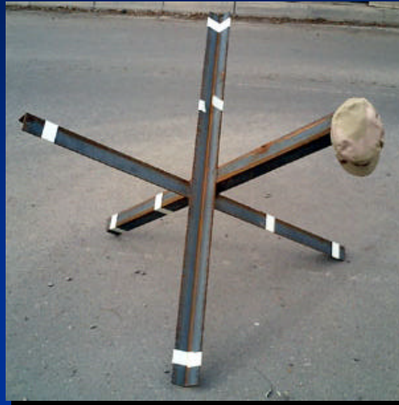
Traffic Jacks Large/Small