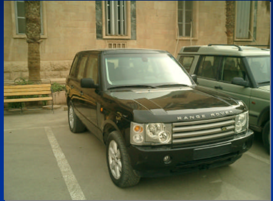
Range Rover (Armored)