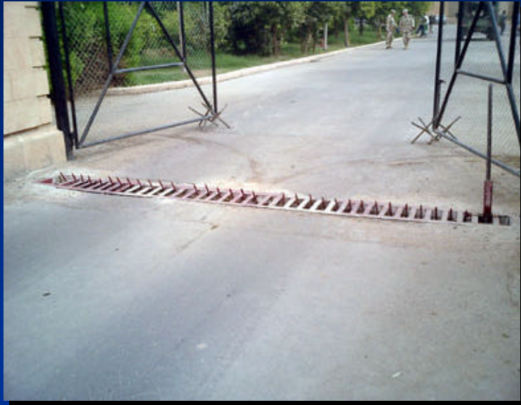
Embedded Spike Strip