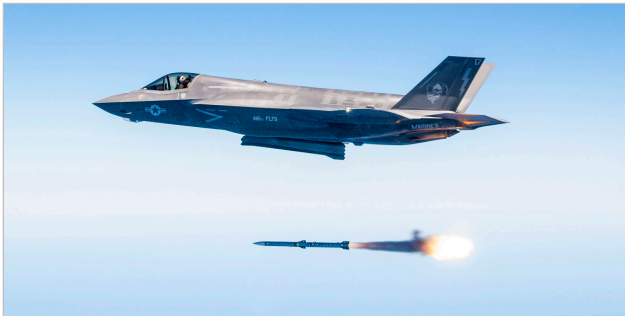
F-35 Lightning II fires an AIM-120 AMRAAM during a weapons test at Edwards Air Force Base, CA

systems. This will make systems operating in the EMS more maneuverable and able to operate in complex EMOEs. To support EMS maneuver, the Department, with emphasis on the Services, will need to evolve and harmonize their requirements for new acquisitions, perhaps incorporating major modifications to existing systems.