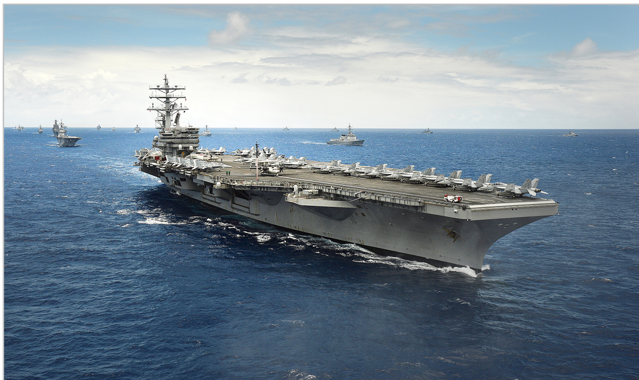
Aircraft Carrier USS Ronald Reagan