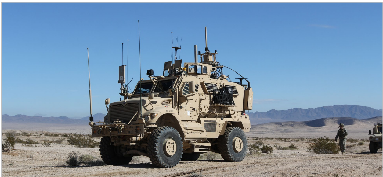
Electronic Warfare Tactical Vehicle

The professionals of the EMS workforce maintain EMS-related specialties in technical and operational EMSO communities (traditionally EMSM and EW). These military and civilian professionals are specially trained and possess EMS expertise that spans the continuum from industry engineer, to tactical employer, to operational commander. All members identified as EMS professionals will be deliberately tracked to enable the Department to sustain a posture of EMS superiority. DoD will update existing and planned formal training and education to ensure the availability of well-rounded EMS Professionals to fill critical billets.