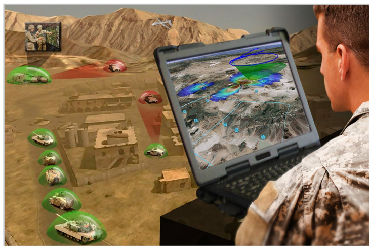
The Electronic Warfare Planning and Management Tool enhances the ability to plan, coordinate, and synchronize electronic warfare, spectrum management, and cyber operations

Future EMBM will feature digital modernization, artificial intelligence (AI), cloud-based data and tools, and integration of the Joint All-Domain Command and Control family of systems with EMBM requirements. This capability ensures timely, decision-quality information is provided at varying levels of classification at all levels of command. Additionally, EMBM must address information sharing requirements with industry and partner nations to maximize spectrum sharing opportunities. This will require analysis using modeling, simulation,