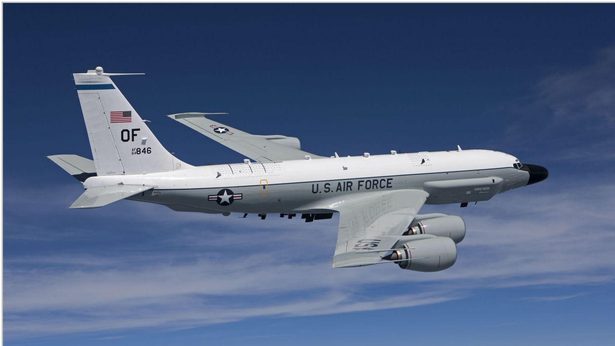
RC-135V/W Rivet Joint reconnaissance aircraft