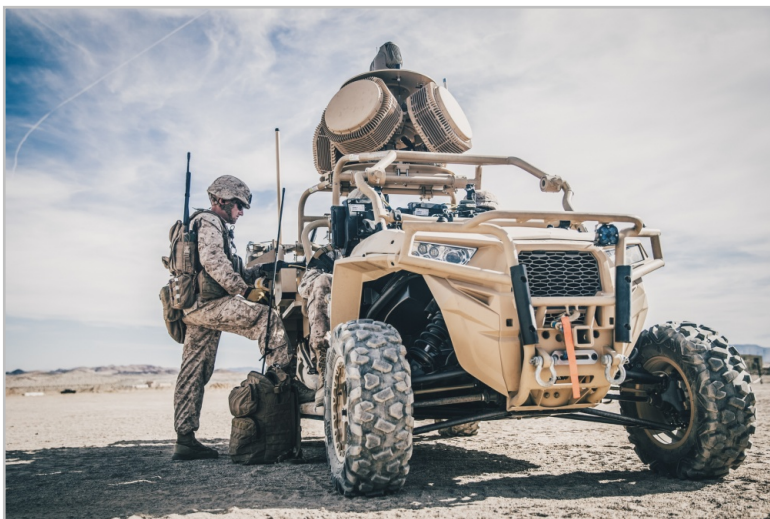
Programming a counter-unmanned aircraft system on a Light Marine Air Defense Integrated System

To enable offensive EMS activities, DoD must field the electromagnetic support (ES) and analytic capabilities that enable full EMS battlespace awareness. These capabilities need to detect, identify, locate and replicate complex emitters/signals of interest rapidly to build situational awareness and enable targeting for both kinetic and non-kinetic fires. These vital corollary systems will unravel the chaos of a congested and contested EMOE and provide near-real-time situational awareness for EMBM as well as real-time targeting information to attack adversary forces as they use the EMS. Networked, adaptive, and distributed, both traditional and non-traditional sensors will provide the integrated data, enabled by machine learning