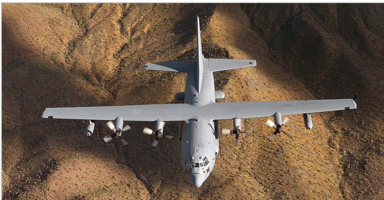
An EC-130H Compass Call flies a training mission over Lake Mead, AZ

EMS superiority brings important advantages to any cost imposition strategy. By developing innovative asymmetric EMS capabilities, DoD can protect expensive friendly capabilities from disruption or attrition, while simultaneously denying or degrading the effectiveness of adversaries' high-priced systems. Because many EMS capabilities are employed, not expended, concerns about magazine capacity or cost of munitions may be reduced, which in turn affords commanders and decision makers more sustainable options. This is especially significant as the United States, its allies and partners, and its adversaries all increase investment in space-based capabilities and dependencies.