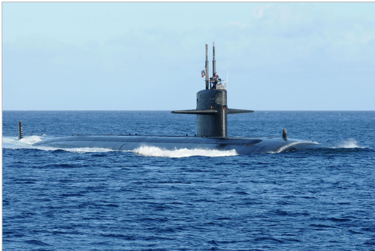
U.S. Navy Los Angeles-class attack submarine

enhance EMS capabilities that will increase our combined coalition EMS capability and capacity with particular focus on near-peer threats. This cooperation includes the need to expand opportunities for coalition EMS testing, training, and education in the United States and abroad.