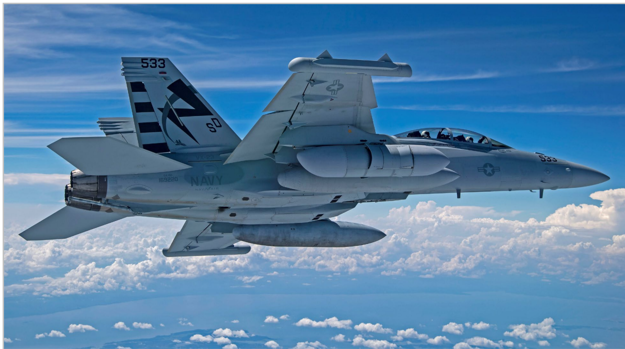
Next Generation Jammer Mid-Band flies for the first time on an EA-18G Growler, Naval Air Station Patuxent River, MD

to advance shared national policy goals. The traditional functions of Electromagnetic Spectrum Management (EMSM) and Electromagnetic Warfare (EW)—integrated as Electromagnetic Spectrum Operations (EMSO)—are addressed within the document’s strategic goals. This 2020 Strategy builds upon the successes of and supersedes both the DoD’s 2013 EMS Strategy and 2017 EW Strategy.