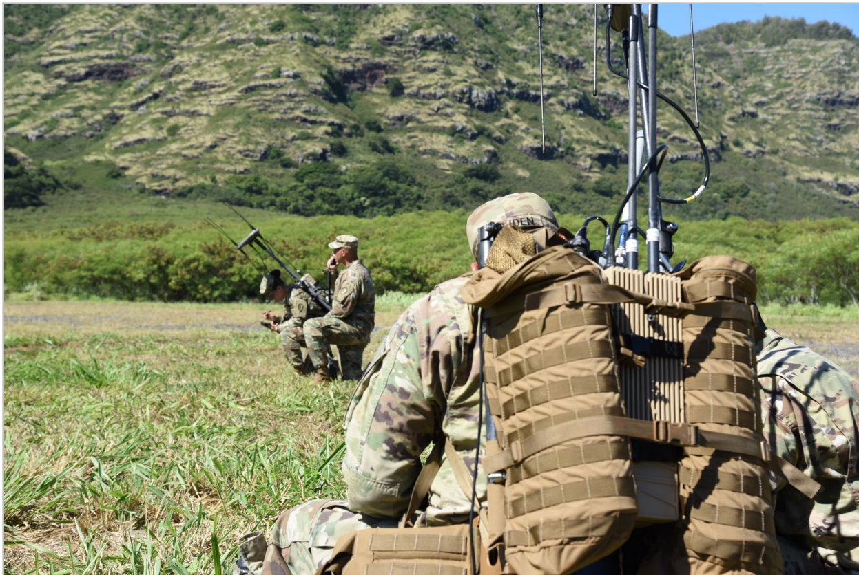
Electronic warfare specialists conduct radio checks before fielding new equipment