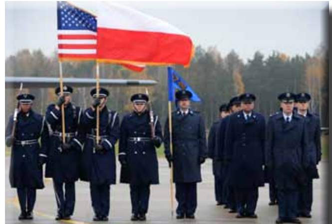
November 9, 2012: Members of the 52nd Operations Group, Detachment 1, conduct the activation ceremony for U.S. Air Force Europe's AVDET on the flight line at Lask Air Base, Poland. Comprised of 10 U.S. Airmen supporting the periodic rotation of U.S. F-16 and C-130 aircraft, the AVDET will make important contributions to Poland's defense modernization and NATO interoperability.

Second, U.S. Air Forces Europe achieved initial operational capability at the newly established European Integrated Air and Missile Defense Center, the only one of its kind, dedicated to advancing BMD