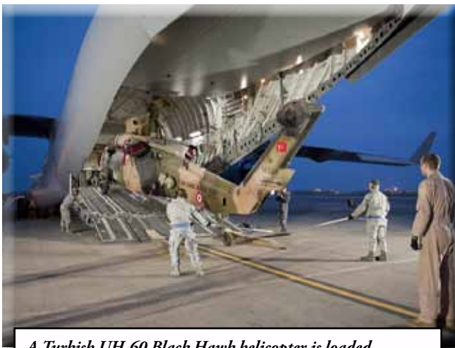
A Turkish UH-60 Black Hawk helicopter is loaded onboard a U.S. Air Force C-17 Globemaster at Incirlik Air Base, Turkey, for deployment to Kabul. EUCOM will provide indispensable logistical capacity and collaboration with U.S. Transportation Command to conduct significant U.S. and allied retrograde and redeployment operations from Afghanistan in 2013 and 2014.

European Command is involved in a wide range of supporting activities to enable a successful transition in Afghanistan in accordance with the 2012 Defense Strategic Guidance and NATO’s Chicago Summit Declaration. As mentioned, European Command continues to leverage Section 1206, Coalition Support Fund, Coalition Readiness Support Program, and a host of other security assistance programs to provide the critical training and equipment that enable our European allies and partners—particularly Central and