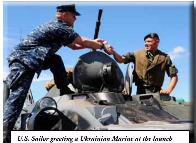
U.S. Sailor greeting a Ukrainian Marine at the launch of Exercise SEA BREEZE '12. Co-hosted by the U.S. and Ukrainian Navies, SEA BREEZE brought together naval, air, and land forces from Algeria, Azerbaijan, Belgium, Canada, Georgia, Germany, Israel, Moldova, Norway, Qatar Sweden, Turkey, UAE, Ukraine, and the United States. The largest multinational exercise conducted in the Black Sea region, SEA BREEZE provides an important venue for U.S. allies and partner nations to improve maritime safety, security, and stability in this vital area.

U.S. Naval Forces Europe continued to lead Eurasia Partnership Capstone, an initiative designed to integrate numerous efforts across Eurasia into a comprehensive maritime partnership. Training with naval forces from Azerbaijan, Bulgaria, Georgia, Greece, Israel, Russia, Poland, Romania, Turkey, and Ukraine, U.S. Naval Forces Europe