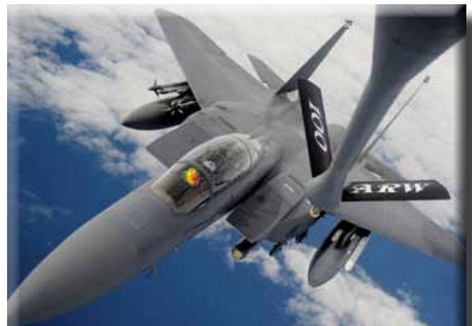
An F-15E Strike Eagle conducts in-flight refueling with a KC-135 Stratotanker over the Atlantic Ocean. U.S. Air Forces Europe conducts operations for 4 U.S. Combatant Commanders—European Command, Africa Command, Central Command, Transportation Command—and supports U.S. commitments to NATO.

Recent combat support operations in North Africa highlighted the importance of our ability to interoperate with NATO and non-NATO coalition partner nations in all phases of the ISR mission. To this end, we have dramatically increased our contact with potential partners to build partner ISR capacity. Leading the success in this area is the joint U.S. / U.K. 'Project Diamond' initiative, begun in 2007, which seeks to develop a Distributed Common Ground System (DCGS) ISR imagery processing, exploitation, and dissemination capability. This capability, located in the United Kingdom, is tied to the 693rd ISR Group at Ramstein Air Base. A significant success story, Project Diamond has resulted in U.K. analysts conducting processing, exploitation, and dissemination (PED) of U.S. Predator and Reaper Unmanned Aerial System operations in Afghanistan since April 2011. These efforts have supported ISAF warfighters while demonstrating the high degree of cooperation that exists between the U.S. and U.K. ISR communities. Building on these lessons, we have launched the Coalition ISR / PED Integration Initiative. This initiative seeks to build and integrate partner ISR capacity among key partner nations in the U.S. European Command and U.S. Africa Command theaters. These efforts will enhance cooperation, facilitate greater burden-sharing,