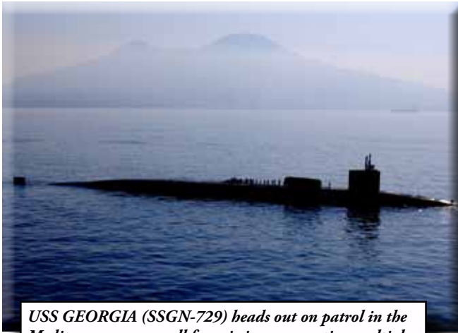
USS GEORGIA (SSGN-729) heads out on patrol in the Mediterranean, on-call for missions supporting multiple U.S. Combatant Commands.

operations, ensure undersea dominance, deliver precision strike weapons, and provide high-value unit protection.