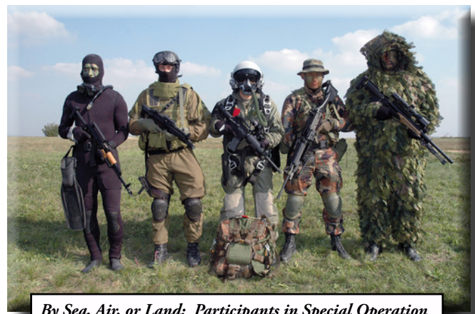
By Sea, Air, or Land: Participants in Special Operation Command Europe's Exercise JACKAL STONE display the uniforms and tools of their trade. The purpose of this capstone exercise is to enhance Special Operations Forces (SOF) capacity and interoperability among 15 participating Allied and partner nations, simultaneously building cooperation and key partnerships for current and future coalition SOF missions.

Exercises, Theater Security Cooperation, and Partnerships: Special Operations Command Europe continued to facilitate SOF interoperability and prepare partners for current and future contingency missions through an intensive 2012 exercise schedule. Last September, Croatia hosted JACKAL STONE '12, our capstone SOF exercise, including 15 nations and over 1,700 participants,