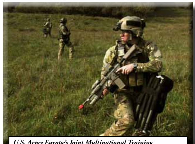
U.S. Army Europe's Joint Multinational Training Command (JMTC) is a strategic national asset, providing U.S. forces and our multinational partners an unparalleled training venue to prepare for ISAF deployments and exercise critical theater security skills. Here, Polish Special Operations Forces conduct search-and-rescue drills as part of a downed-aircraft exercise in Hohenfels, Germany.

Leveraging U.S. Army Europe's forward deployed brigades and America's long-standing investment in the premier training facilities at the Joint Multinational Training Command (JMTC) in Grafenwoehr and Hohenfels, Germany, U.S. Army Europe trained and mentored 2,481 multinational soldiers from 22 countries in counter-improvised explosive device (C-IED) skill sets, and trained 1,204 multinational drivers on Mine Resistant Ambush Protected (MRAP) vehicles. U.S. Army Europe teams also mentored and advised the Afghan National Army and Afghan National Police. In partnership with NATO, four mission rehearsal exercises were conducted at JMTC in 2012, training 72 mentoring and advisory teams from 16 European partner nations to support ISAF. U.S. Army Europe also enabled 190 National