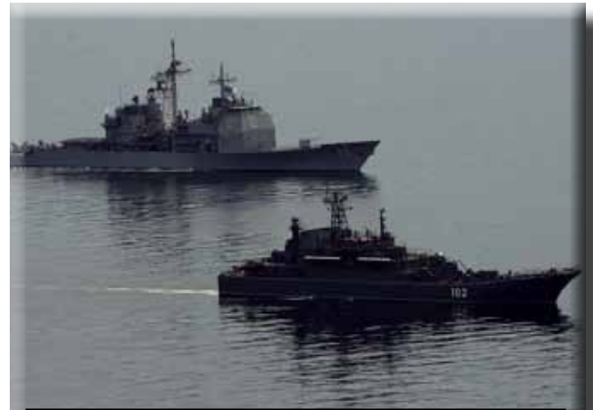
USS Normandy (CG 60) and Russian Federation Ship (RFS) Kaliningrad (LSTM 102) conduct anti-piracy training on the high seas. Naval operations, from counter-piracy to counter-trafficking to search-and-rescue, remain an important zone of cooperation for continued constructive U.S.-Russian engagement.

Militarily, Russia seeks to enhance its regional influence and leverage through participation with former Soviet states in the Collective Security Treaty Organization (membership includes Armenia, Belarus, Kazakhstan, Kyrgyzstan, Russia, and Tajikistan), as well as a robust defense build-up through its ‘State Armament Plan.’ That plan calls for the construction and modernization of: naval surface combatants and submarines; air defense brigades; attack helicopters; developments in fifth generation fighters; and the continued maintenance of its existing strategic and tactical nuclear weapons. At the same time, Russia faces many challenges, including declining demographics, a high rate of drug and alcohol abuse, a relatively narrow economic base stemming from oil and gas, and uneven infrastructure. While appropriately anticipating these developments, European Command will continue to seek and leverage existing and emerging zones of cooperation as a priority and focus for our current and future engagement with Russia.