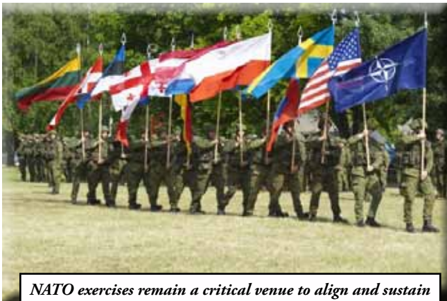
NATO exercises remain a critical venue to align and sustain high-end capabilities among NATO's most developed partners for continued burden-sharing; preserve a decade of hard-earned Alliance expeditionary capabilities; and support newer Allies' capability development for current and future NATO operations.

for newer members of the alliance, as well as our other NATO partners, to pair with some of the highly-capable founding members, continuing to burden-share collective defense while raising the overall quality of NATO forces.