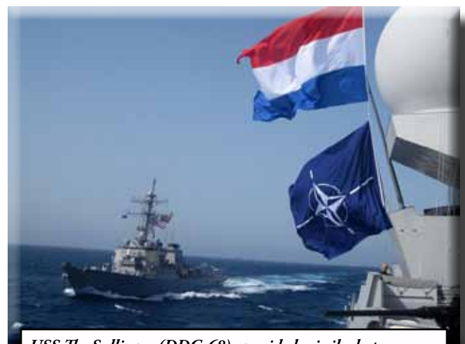
USS The Sullivans (DDG-68), a guided missile destroyer, conducts at-sea training with Royal Netherlands Navy frigate HNLMS De Ruyter (F804). Allied maritime support includes ‘riding shotgun’ to protect U.S. Aegis BMD platforms, an important contribution to the Ballistic Missile Defense mission. The Netherlands Navy is also pursuing maritime upper-tier BMD tracking capabilities for their vessels.

Ballistic Missile Defense. The protection of NATO European territory, populations, and forces against ballistic missiles from increasing threats to the alliance is vitally important. NATO declared an Interim Ballistic Missile Defense (BMD) capability at the May 2012 Chicago Summit. As mentioned, the U.S. AN/TPY-2 surveillance radar based in Turkey has been declared to NATO as a part of EPAA’s Phase One implementation. The initial operational capability of NATO BMD is anticipated in 2016, with full operational capability in 2020.