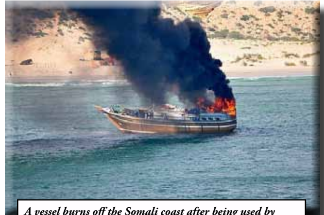
A vessel burns off the Somali coast after being used by pirates to attack the Dutch warship HNLMS Rotterdam. HNLMS Rotterdam, NATO's counter-piracy flagship, returned fire, disabling the vessel and scattering the attackers. NATO's Operation OCEAN SHIELD, in coordination with shipping industry best practices, continues to reduce episodes of piracy in waters off the Horn of Africa.

NATO Members Defense Commitments & Budgeting Outlook. The European financial crisis has had a security impact on NATO and partner nations. Few allies currently meet the NATO goal that each ally commits 2% of GDP to defense spending. The Smart Defense Initiative, Connected Forces Initiative, and NATO Forces 2020 all strive to fill capacity and capability gaps. However, at a time of uncertain security challenges and severe fiscal austerity it remains difficult, but still critical, to adequately fund defense spending.