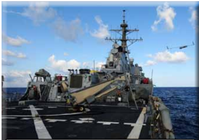
USS McFAUL (DDG-74), an Arleigh-Burke class guided missile destroyer launching a 'Scan Eagle' UAV during Operation JUKEBOX LOTUS last September. These versatile platforms cover multiple theater missions, from Ballistic Missile Defense to maritime interdiction to expanded U.S. Intelligence, Surveillance, and Reconnaissance.

Intelligence, Surveillance and Reconnaissance (ISR). U.S. Naval Forces Europe supported theater ISR objectives with persistent coverage of vital operating areas, using air, surface, and subsurface assets. U.S. Navy surface combatants conducted active radar surveillance of airspace over or near regions of potential volatility to provide indications and warnings of aircraft activity as well as surveillance of surface