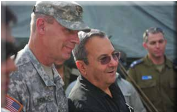
Israeli Minister of Defense Ehud Barak speaks with U.S. forces during Exercise AUSTERE CHALLENGE in October, 2012. AUSTERE CHALLENGE was the largest exercise conducted in EUCOM since the end of the Cold War. It involved 3,500 U.S. and 1,000 Israeli forces exercising critical air and missile defense capabilities.

AUSTERE CHALLENGE. In its eighth year as European Command's premier joint force headquarters exercise, AUSTERE CHALLENGE 12—the largest and most significant exercise ever to