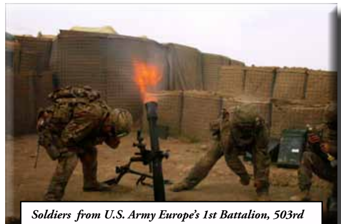
Soldiers from U.S. Army Europe's 1st Battalion, 503rd infantry, 173rd Airborne Brigade Combat Team fire an 81-mm mortar while executing operations at Combat Outpost Kherwar, Afghanistan, on August 6, 2012.

Operations & Operational Support: U.S. Army Europe stands ready to support contingency operations and meet future global threats. Though some operations have been ongoing for years, others are completely new and unexpected, requiring flexibility and innovation to support. Last year, an average of 20% of U.S. Army Europe's forces were deployed to support to U.S. Central Command and ISAF. In 2012 alone, the U.S. Army's V Corps, 173rd Airborne BCT, and 12th Combat Aviation Brigade all deployed to Afghanistan.