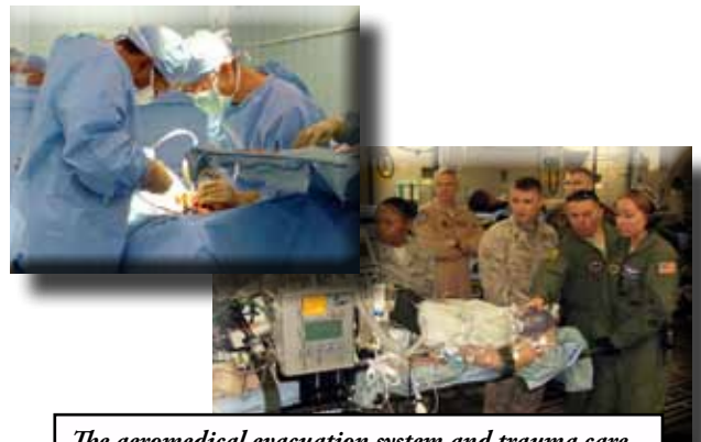
The aeromedical evacuation system and trauma care provided at U.S. medical facilities in Germany have saved thousands of lives and driven U.S. combat-related deaths to historic lows. Sustaining these capabilities is critical to ensuring their continued availability for U.S. military personnel serving across half the globe, including areas of persistent conflict in Africa and the Middle East.

The Landstuhl / Rhine Ordnance Barracks Medical Center replacement project remains one of the command's highest military constructions priorities. FY 2012 and 2013 funding support have greatly facilitated the project's progress to date. The new facility consolidates duplicative medical facilities in the Kaiserslautern Military Community, and provides a vitally important replacement to theater-based combat and contingency operation medical support from the aged and failing infrastructure at the Landstuhl Regional Medical Center. This recapitalization project will provide life-saving intervention, combat trauma,