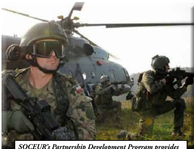
SOCEUR's Partnership Development Program provides valuable support and pre-deployment training for partner-nation SOF forces, including Poland (shown above). These nations have made, and continue to make, vital contributions to ISAF.

Operations & Operational Support: Special Operations Command Europe continues to lead European Command's SOF support to U.S. Central Command and the mission in Afghanistan. For the sixth year in a row, Special Operations Command Europe has provided U.S. forces, directly supporting ISAF through the deployment of Combined Special Operations Task Force 10 (CSOTF-10), providing