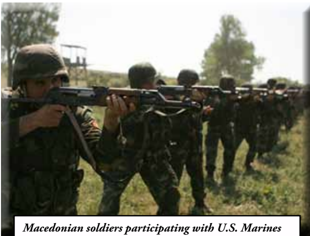
Macedonian soldiers participating with U.S. Marines from the Black Sea Rotational Force in the Marine Corps Combat Marksmanship Program sharpening their tactics, techniques, and procedures in essential military skills.

BSRF focuses its partner engagement on tasks that prepare and train these regional partners for out-of-area operations. The program builds enduring trust while enhancing U.S. strategic objectives in the region. In 2012, BSRF supported European Command crisis response requirements through its capabilities