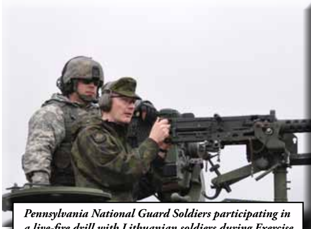
Pennsylvania National Guard Soldiers participating in a live-fire drill with Lithuanian soldiers during Exercise SABER STRIKE held in Adazi, Latvia. Lithuania is paired with Pennsylvania under the State Partnership Program. Lithuanian troops joined with 2,000 other forces from Latvia, Estonia, Finland, Canada, France and the United Kingdom for this important Baltic-focused multinational security exercise.

Armenian military. In Azerbaijan, European Command also involved Azerbaijan forces in the Black Sea Rotational Force, coordinated training events at the Joint Multinational Training Center in Germany, and provided Section 1206-funded explosive ordnance disposal (EOD) training to Naval Special Operations Forces.