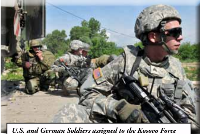
U.S. and German Soldiers assigned to the Kosovo Force (KFOR) provide perimeter security during roadblock removal operations on June 1, 2012 near Mitrovica, Kosovo. Border tensions in northern Kosovo continue to bear close watching, and require KFOR to maintain current force levels for now to ensure stability and support the ongoing Pristina-Belgrade dialogue.

Serbia's refusal to date to normalize relations with Kosovo – as well as actions by hardliners and criminal elements in northern Kosovo – have hampered Pristina's ability to extend its authority to its