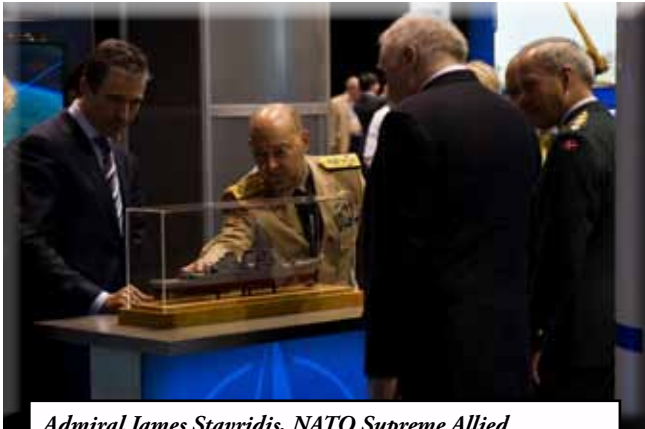
Admiral James Stavridis, NATO Supreme Allied Commander, Europe, describes shipboard capabilities for the NATO Ballistic Missile Defense program to NATO Secretary General Anders Fogh Rasmussen, NATO Military Committee Chairman General Knud Bartels, and other officials during the NATO Summit in Chicago last May.

Accordingly, European Command continues to make significant progress in implementing the President's European Phased Adaptive Approach (EPAA) to missile defense. EPAA Phase One is complete, with the AN/TPY-2 land-based radar established and operating from eastern Turkey, U.S. Navy Aegis BMD