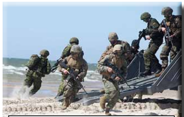
U.S. Marines and amphibious forces from Latvia, Lithuania, Estonia, Poland, the Netherlands, and Germany hit the beach during Exercise Baltic Operations (BALTOPS) 2012. BALTOPS '12 reinforced key theater security cooperation efforts through joint maritime, air, and land operations conducted across the Baltic region.

Way Ahead. Marine Forces Europe will continue to pursue an innovative task-organized expeditionary force presence in the European Command theater to meet crisis and contingency response requirements. We will provide bilateral combined arms and amphibious training with key partners, including Israel, Turkey, France, and the United Kingdom. Establishing and exercising expeditionary presence supports important theater reassurance and deterrence objectives. Marine Forces Europe will continue to support Service-led efforts to transform the MCPN, while maintaining our commitment to the reinforcement of Norway. Additionally, Marine Forces Europe will continue to evolve BSRF's crisis response capability, fully aligning this force with maritime crisis response capabilities inside the European Command theater.