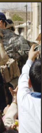
s and nation e the Iraqi of

A unique USSOCOM contribution to creating a global antiterrorist environment involves its strategic Psychological Operations (PSYOP) capabilities. Strategic PSYOP are those actions or activities designed to promote the truth and influence foreign audiences in support of U.S. Government objectives. This capability is used in areas or situations that are particularly sensitive, require a large degree of senior-level oversight, or have significant impact on the governance of foreign nations and populations. USSOCOM's Joint Psychological Operations Support Element (JPSE) is a key component for conducting trans-regional PSYOP in support of the GWOT. USSOCOM established the JPSE to address an identified shortcoming of a strategic PSYOP capability within DOD following the attacks on 11 September 2001. It focuses on denying safe-haven to terrorists abroad and countering global terrorist ideology and influence with strategic and trans-regional PSYOP prototypes and activities. Trans-regional PSYOP are conducted under the authorities of USSOCOM or the GCCs, and are always in coordination with local U.S. Ambassadors and the interagency.