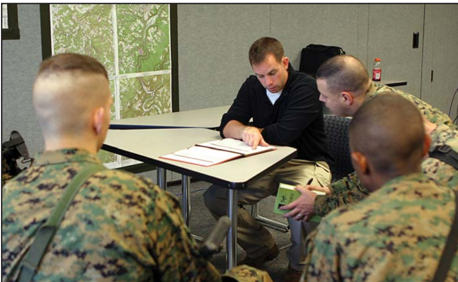
Marine Corps Forces Special Operations Command Marines participate in linguistic training.

For example, the Joint Special Operations Warrior Certificate is already underway, which defines and prioritizes the competencies that SOF mid-level grades should have to focus on the operational level of warfare. This certificate program focuses on current missions, joint doctrine, SOF capabilities, interoperability, planning, and similar operational issues facing the joint SOF operator and SOF enabler. A USSOCOM Staff Operations certificate to prepare non-SOF personnel to operate as effective members of the various SOF command staffs