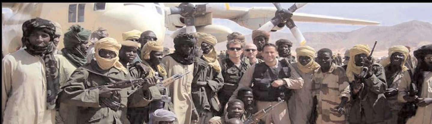
Air Force Special Operations Command advisors pose with members from the Chadian Air Force.