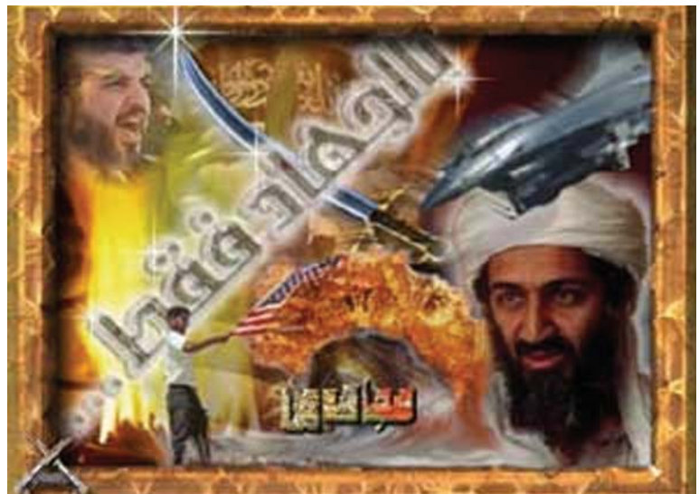
An al-Qaida website image claiming responsibility for attacks in Kenya and the United States.

For militant Islamic terrorists, there can be no peaceful coexistence with those who do not subscribe to their world view. There will be no compromise and no consideration of conflicting viewpoints – creating the need for our resolve and commitment in the long war.