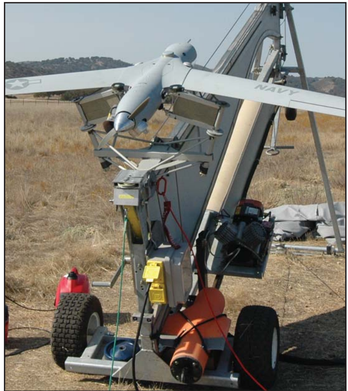
A Scan Eagle unmanned aerial vehicle sits on a launch sled during USSOCOM sponsored Tactical Network Topography 07-1 experiment at Camp Roberts, Calif.

The Special Operations Special Technology (SOST) program demonstrates and evaluates emerging and advanced technologies in relevant SOF environments. SOST projects are oriented towards the development of more mature technologies and prototypes to mitigate or eliminate capability gaps. Efforts are focused on a