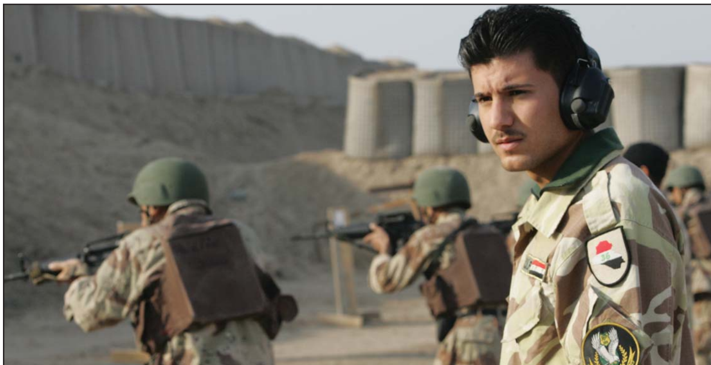
A U.S. SOF-trained Iraqi special operations forces advisor oversees training of his fellow countrymen at a training compound.

In Iraq, U.S. Army Special Forces and U.S. Navy SEALs have significantly expanded Foreign Internal Defense (FID) operations. Training and advising the Iraqi Special Operations Forces is still a main focus of SOF's efforts, but in 2006 several other regular Iraqi army and security forces were included as well. For example, SEALs trained approximately 1500 Iraqi army and police personnel within the past year, executing over 400 combined combat operations. Mentorship of Iraqi units has matured to the point that they have increasingly conducted unilateral operations without the presence of U.S. advisors. SEALs and Special Forces also played a key role in tribal engagement efforts in Al Anbar province, establishing relationships with tribal sheiks that resulted in the recruitment of 300 local tribesmen into the Iraqi police. These successes culminated in 2006, but they did not happen overnight. They are the result of patience and persistence over months and years, demonstrating the generational aspect required of the indirect approach in