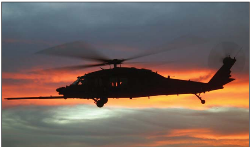
A MH-60 from the 160th Special Operations Aviation Regiment (Airborne) conducting operations over Iraq.

In support of European Command, SOF deployed to Africa numerous times in 2006 in support of Operation Enduring Freedom Trans Sahara (OEF-TS) and the Trans Sahara Counterterrorism Initiative. Leveraging an indirect approach, SOF employed a wide range of joint elements to all nine OEF-TS partner nations. The focus was to provide training and assistance to the host countries to develop their indigenous capacity to combat terrorism and create a more secure and stable environment. A highlight for OEF-TS in 2006 was the deployment to Chad of two Foreign Military Training Units (FMTU) from the Marine Corps Forces Special Operations Command (MARSOC). For six weeks, the FMTUs formed, trained, equipped, and assessed a battalion from the Chadian anti-terrorism regiment on a broad range of individual and unit skills, to include officer tactical planning and leadership courses. The trained anti-terrorism battalion is now capable of