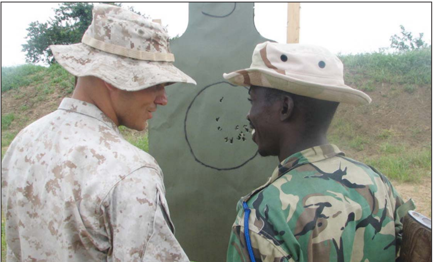
Persistent engagement with our partner nations is key to success in the long war.

supporting the GWOT. Effectively integrating USSOCOM's lessons learned and those of our joint, multinational, interagency, intergovernmental, and Coalition special operations partners is crucial to countering and defeating international terrorism threats. The current Lessons Learned program at USSOCOM is shifting its emphasis from passive collection and archiving lessons observed to a new, more aggressive paradigm. This evolution centers around robust active collection with detailed analysis that is integrated throughout the Command's Strategic Planning Process, the resourcing process, the USSOCOM Long Range Planning Process, and many other processes with resolution of issues and dissemination to SOF and joint communities as the primary goals. The difference in a lesson observed and a lesson learned is the application of corrective action and resourcing to effect change of a process, a piece of equipment, or the manner in which personnel are trained. As lessons learned must be incorporated into the allocation of dollars they must also be considered when developing the operational concepts for future SOF concepts.