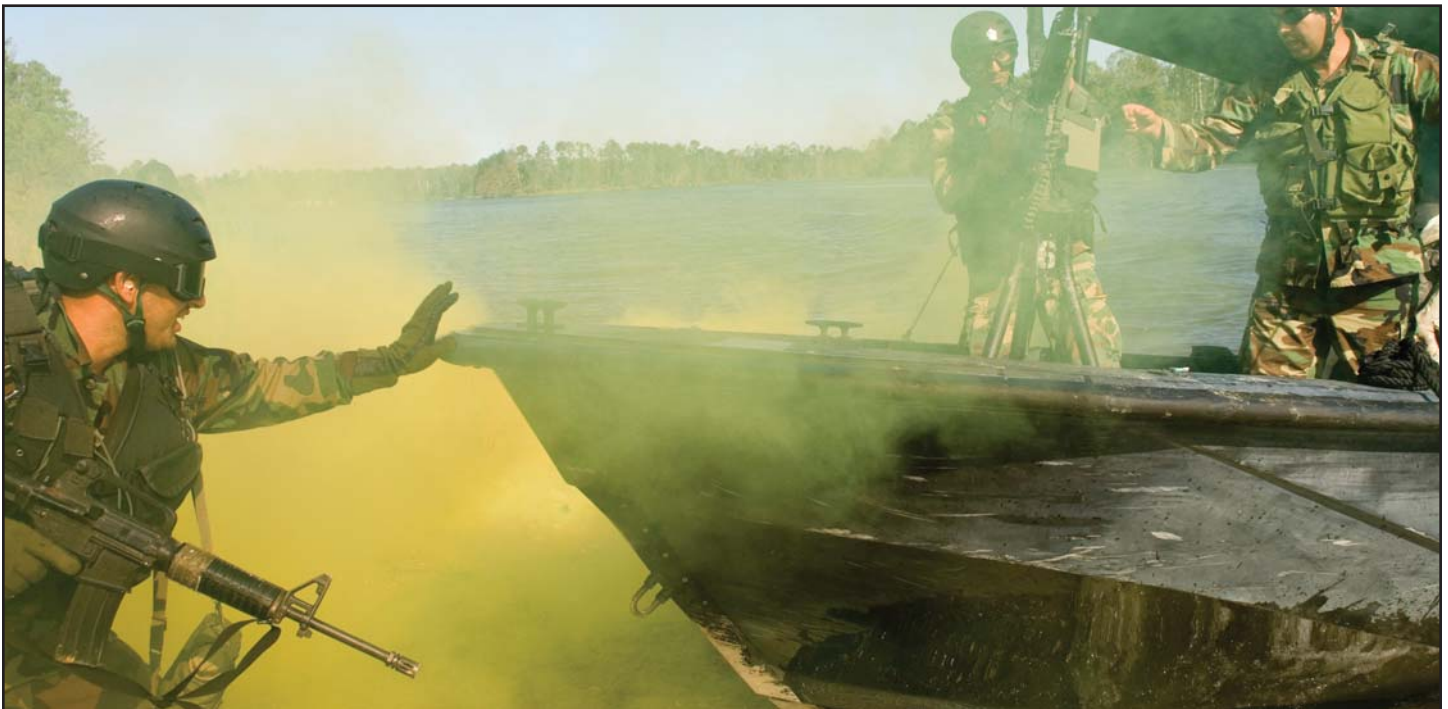
Naval Special Warfare personnel assigned to Naval Small Craft Instruction and Technical Training School train personnel from the Iraqi Riverine Police Force on special boat maneuvers and weapon handling.

graduates from the training pipelines while maintaining quality in the process. The U.S. Army Special Operations Command (USASOC) showed large gains in FY 2006 after increasing instructors and totally redesigning the Special Forces Qualification Course curriculum. A phased plan was implemented to grow from a historic average of 400-450 active duty enlisted graduates per year to 750 for FY 2006. USASOC exceeded this goal, with 762 active duty enlisted Special Forces Soldiers graduating in FY 2006. The Naval Special Warfare Command (NAVSPECWARCOM) is still facing challenges filling SEAL billets, but the Chief of Naval Operations' commitment to SEAL recruitment as a top Navy priority is helping enormously. Additionally, NAVSPECWARCOM introduced several initiatives to their training programs to increase output while maintaining current standards. Air Force Special Operations Command (AFSOC) heavily revised its training pipeline over the last few years, which began to pay significant dividends as evidenced by increasing numbers of newly qualified operators. Based on current production, AFSOC should reach its required manning levels by FY 2009. Our newest component, MARSOC, continues to grow as planned and will be fully manned by FY 2008.