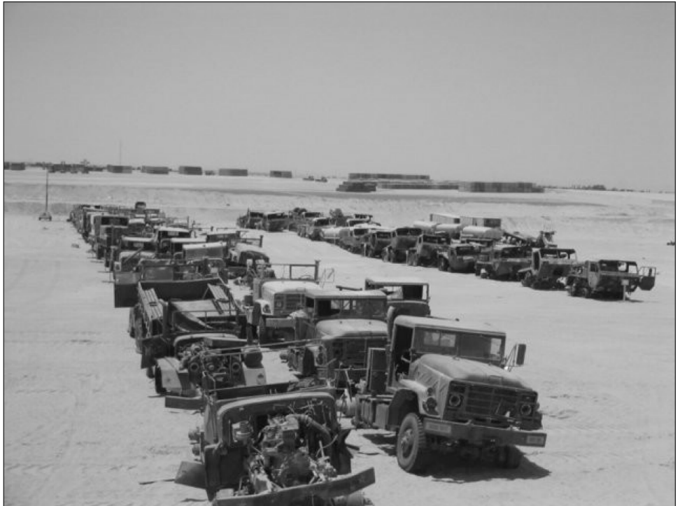
Figure 2: Some Trucks Used in OIF that Need Repair