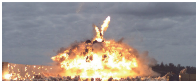
Figure 2. Still photograph from MK 84 vertical arena test