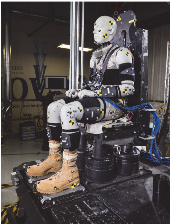
Figure 6. WIAMan Technology Demonstrator