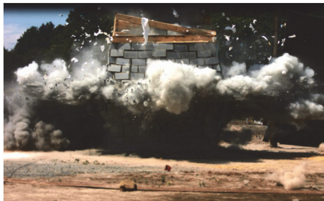
Figure 3. Concrete masonry unit for characterizing building debris