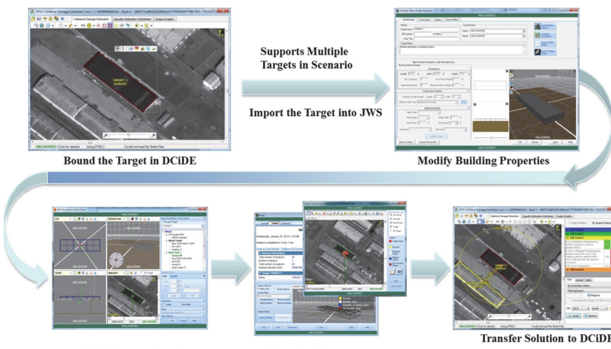
Figure 1. Connectivity between Weaponering and Collateral Damage Assessment Enables Combatant Commanders to More Rapidly Prosecute Targets

In FY16, JTCG/ME released DCiDE v2.0 to support the Chairman of the Joint Chiefs of Staff Instruction 3160.01B, “No-Strike and the Collateral Damage Estimation (CDE) Methodology.” This release provides the latest approved Collateral Effect Radii (CER) and CDE data as of FY16.